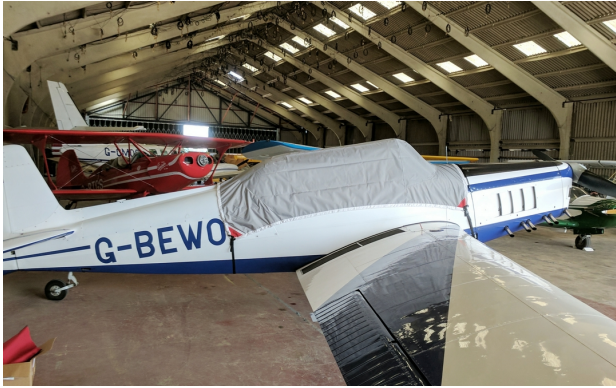
Zlin 326 Travel Cover

Travel Covers are made with Silver Solution-Dyed Polyester fabric and only lined over the windshield to save weight. The material is lightweight and more compact for easy stowage in the aircraft. The polyester material is water resistant, but only intended for occasional use outside. We also have an ultra lightweight material available for fitted hangar dust covers. For daily outdoor use, the non-travel Sunbrella Cover is the best choice.