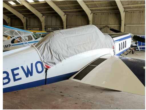
Zlin 326 Travel Cover