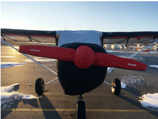
Cessna 172M Canopy, Wings, Horiz. Stab., Insulated Engine & Prop Covers