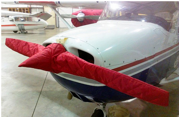
Cessna 172 2-blade Insulated Propellor/Spinner Cover

This cover type is made from Silver Acrylic Sunbrella canvas and is 100% lined with a soft and smooth microfiber. Bruce's Custom Covers developed this material combination especially for aircraft protection. The outer material is medium weight and treated for water resistance, UV resistance and anti-static buildup. The inner lining is a very soft and smooth microfiber to prevent scratching. The material is very reflective, and tests show that the cabin interior temperature can be reduced to near-ambient temperature on the hottest of days. It is water, ice and snow repellent, yet breathable to allow moisture to escape from between the cover and the aircraft surface.