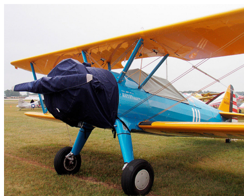
Stearman Canopy, Engine & Prop Covers