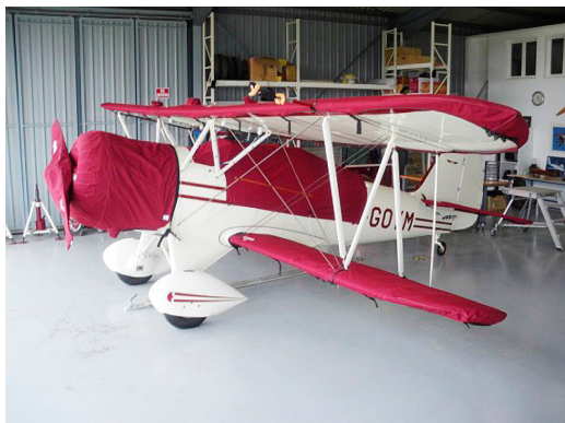
Waco UPF-7 Canopy, Wings, Stab's, Engine, Prop Covers

WINTER USE MATERIAL - Made with Solution-Dyed Polyester fabric, this option is intended for seasonal use to aid in deicing, rain mitigation, or for occasional travel. The material is lighter and more compact, but more susceptible to UV damage and may have a shorter useful life if used continuously outside than the all-year use material.