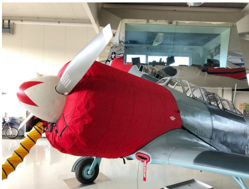
Yak 11 Insulated Engine Cover & Oil Cooler Inlet Plug

This cover type is made from Silver Acrylic Sunbrella canvas and is 100% lined with a soft and smooth microfiber. Bruce's Custom Covers developed this material combination especially for aircraft protection. The outer material is medium weight and treated for water resistance, UV resistance and anti-static buildup. The inner lining is a very soft and smooth microfiber to prevent scratching. The material is very reflective, and tests show that the cabin interior temperature can be reduced to near-ambient temperature on the hottest of days. It is water, ice and snow repellent, yet breathable to allow moisture to escape from between the cover and the aircraft surface.