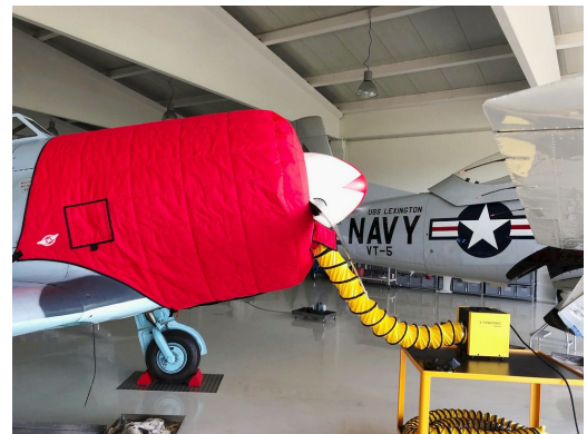
Yak 11 Insulated Engine Cover