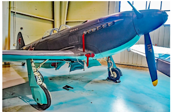
Yakovlev Yak 3 Oil Cooler Inlet Plugs (In Wing Root), Belly Scoop Plug