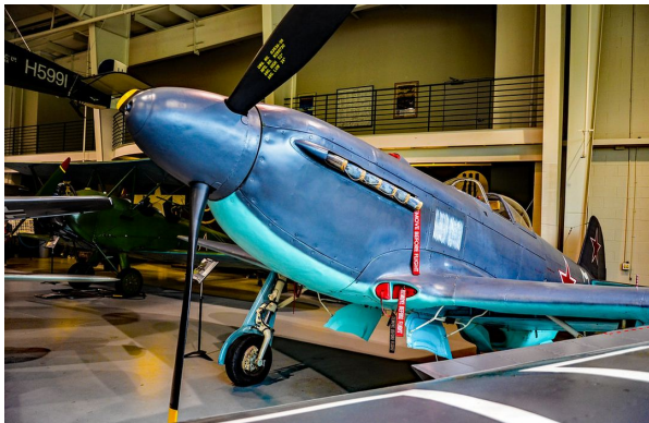
Yakovlev Yak 3 Oil Cooler Inlet Plugs

Engine Inlet Plugs are custom fit for your Yakovlev Yak 3 intakes, made with heavy-duty vinyl material, and stuffed with a single block of sculpted urethane foam. Each plug has a zipper that allows the foam to be removed and dried if necessary. Engine plugs have warning flags that are visible from the cockpit or 'remove before flight' streamers sewn onto the face of the plugs. Most plugs are imprinted with the aircraft registration number in black for an extra charge. Storage bag NOT included. Engine plugs may be inserted after flight when the engine is still warm. Engine Inlet Plugs are commonly referred to as Cowl Plugs, Intake Plugs, Cowl Blocks, Engine Blocks, and Engine Bungs.