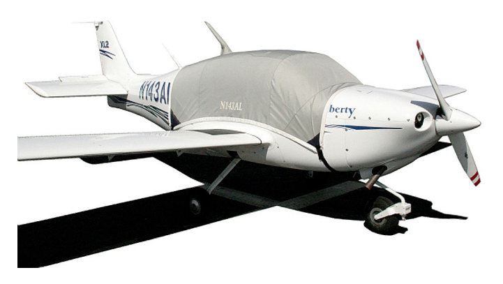
XL-2 Canopy Cover

This cover type is made from Silver Acrylic Sunbrella canvas and is 100% lined with a soft and smooth microfiber. Bruce's Custom Covers developed this material combination especially for aircraft protection. The outer material is medium weight and treated for water resistance, UV resistance and anti-static buildup. The inner lining is a very soft and smooth microfiber to prevent scratching. The material is very reflective, and tests show that the cabin interior temperature can be reduced to near-ambient temperature on the hottest of days. It is water, ice and snow repellent, yet breathable to allow moisture to escape from between the cover and the aircraft surface.