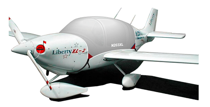
XL-2 Canopy Cover & Engine Plugs (Illustration)