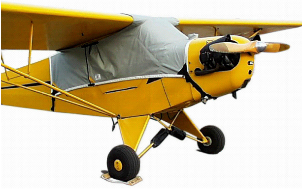
Piper J3 Canopy Cover