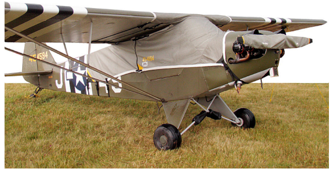
Piper J3 Extended Canopy Cover & Propellor Cover