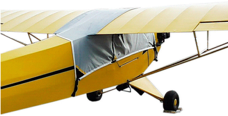
Piper J3 Over-Top Canopy Cover