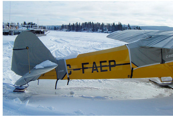
Piper J3 Cub Abbreviated Empennage Cover, Wing Covers and Canopy Cover