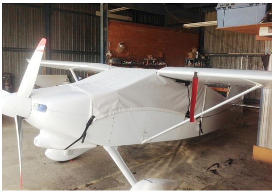
Wittman Tailwind Canopy Cover

This cover type is made from Silver Acrylic Sunbrella canvas and is 100% lined with a soft and smooth microfiber. Bruce's Custom Covers developed this material combination especially for aircraft protection. The outer material is medium weight and treated for water resistance, UV resistance and anti-static buildup. The inner lining is a very soft and smooth microfiber to prevent scratching. The material is very reflective, and tests show that the cabin interior temperature can be reduced to near-ambient temperature on the hottest of days. It is water, ice and snow repellent, yet breathable to allow moisture to escape from between the cover and the aircraft surface.