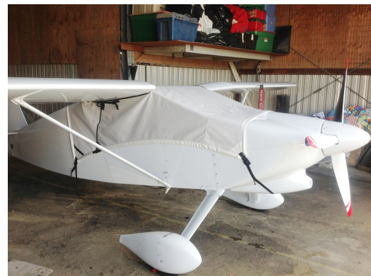
Wittman Tailwind Canopy Cover