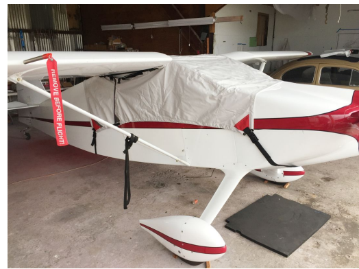
Wittman Tailwind Canopy Cover, Over-The-Top