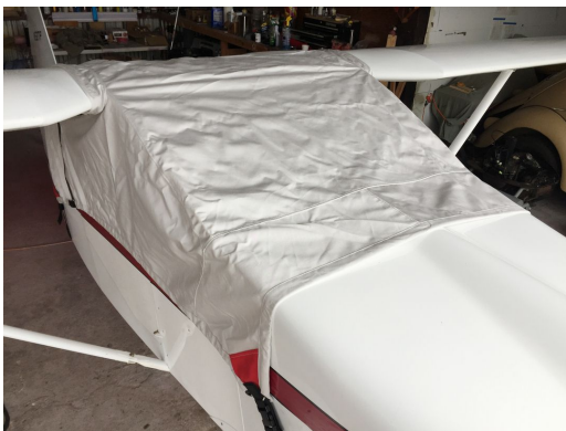
Wittman Tailwind Canopy Cover, Over-The-Top

This cover type is made from Silver Acrylic Sunbrella canvas and is 100% lined with a soft and smooth microfiber. Bruce's Custom Covers developed this material combination especially for aircraft protection. The outer material is medium weight and treated for water resistance, UV resistance and anti-static buildup. The inner lining is a very soft and smooth microfiber to prevent scratching. The material is very reflective, and tests show that the cabin interior temperature can be reduced to near-ambient temperature on the hottest of days. It is water, ice and snow repellent, yet breathable to allow moisture to escape from between the cover and the aircraft surface.