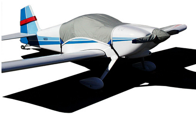
Canopy Cover, Prop Cover

This cover type is made from Silver Acrylic Sunbrella canvas and is 100% lined with a soft and smooth microfiber. Bruce's Custom Covers developed this material combination especially for aircraft protection. The outer material is medium weight and treated for water resistance, UV resistance and anti-static buildup. The inner lining is a very soft and smooth microfiber to prevent scratching. The material is very reflective, and tests show that the cabin interior temperature can be reduced to near-ambient temperature on the hottest of days. It is water, ice and snow repellent, yet breathable to allow moisture to escape from between the cover and the aircraft surface.