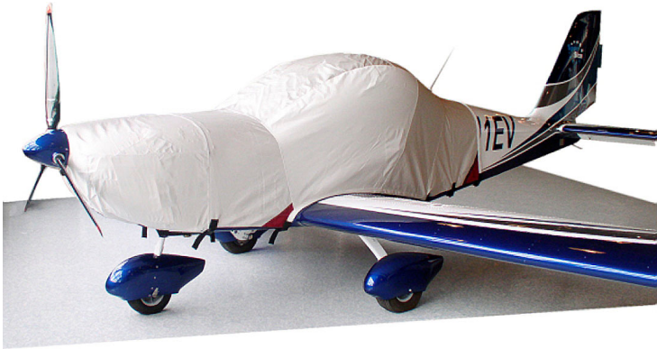
Ekvork Sportstar Extended Canopy/Engine Cover

This cover type is made from Silver Acrylic Sunbrella canvas and is 100% lined with a soft and smooth microfiber. Bruce's Custom Covers developed this material combination especially for aircraft protection. The outer material is medium weight and treated for water resistance, UV resistance and anti-static buildup. The inner lining is a very soft and smooth microfiber to prevent scratching. The material is very reflective, and tests show that the cabin interior temperature can be reduced to near-ambient temperature on the hottest of days. It is water, ice and snow repellent, yet breathable to allow moisture to escape from between the cover and the aircraft surface.