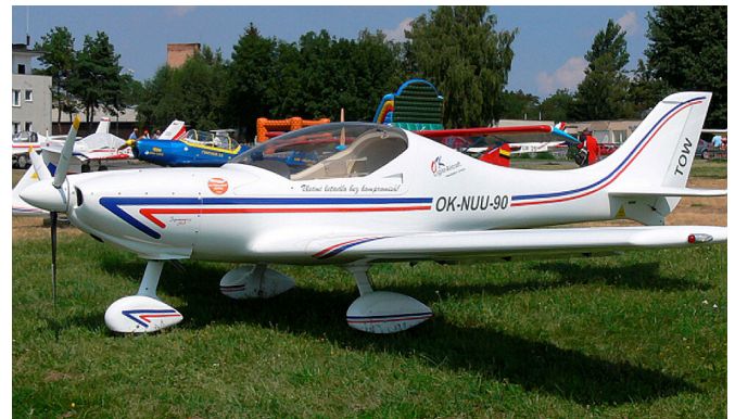
Covers, Plugs & HeatShields for Dynamic WT9