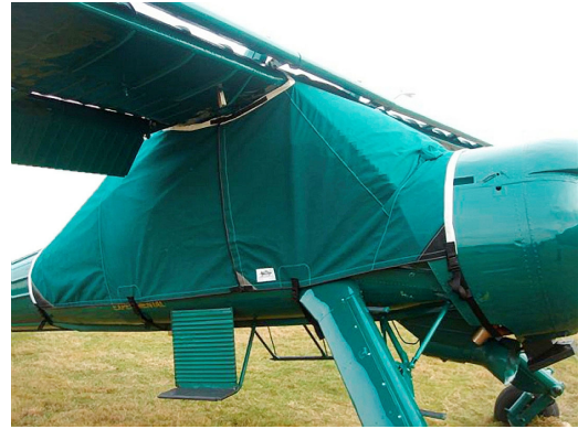
Wilga Canopy Cover