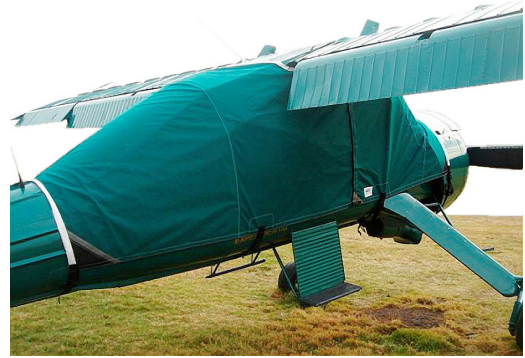
Wilga Canopy Cover