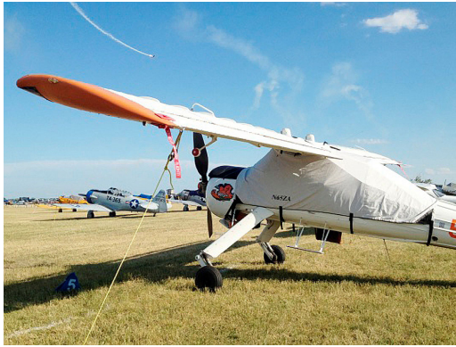
Wilga Canopy Cover

water resistance, UV resistance and anti-static buildup. The inner lining is a very soft and smooth microfiber to prevent scratching. The material is very reflective, and tests show that the cabin interior temperature can be reduced to near-ambient temperature on the hottest of days. It is water, ice and snow repellent, yet breathable to allow moisture to escape from between the cover and the aircraft surface.