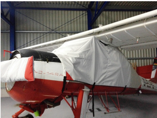
Wilga Canopy Cover and Prop Cover