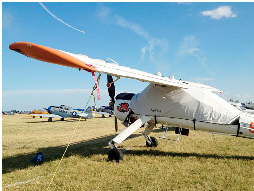
Wilga Canopy Cover

water resistance, UV resistance and anti-static buildup. The inner lining is a very soft and smooth microfiber to prevent scratching. The material is very reflective, and tests show that the cabin interior temperature can be reduced to near-ambient temperature on the hottest of days. It is water, ice and snow repellent, yet breathable to allow moisture to escape from between the cover and the aircraft surface.