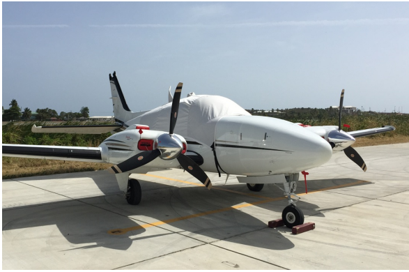
Baron 58 Canopy Cover, Engine Plugs

the hottest of days. It is water, ice and snow repellent, yet breathable to allow moisture to escape from between the cover and the aircraft surface.