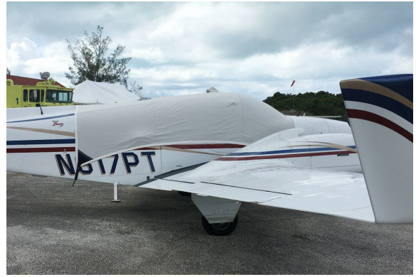
Beech Baron 58 Canopy Cover