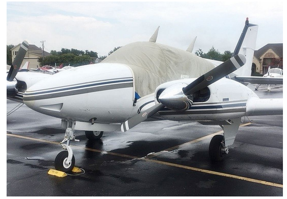
Beech Baron Canopy Cover