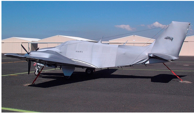
Baron FULL COVER SET, Light Weight Travel &/or Fitted Dust Cover Set