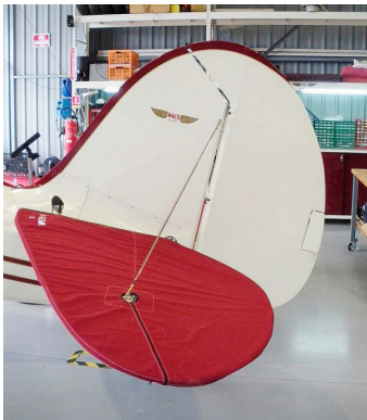
Waco UPF-7 Horizontal Stab. Cover

WINTER USE MATERIAL - Made with Solution-Dyed Polyester fabric, this option is intended for seasonal use to aid in deicing, rain mitigation, or for occasional travel. The material is lighter and more compact, but more susceptible to UV damage and may have a shorter useful life if used continuously outside than the all-year use material.