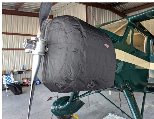
Wacon Cabin Biplane ZQC-6 Insulated Engine Cover