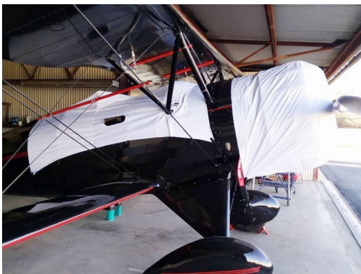
Waco UMF Canopy & Engine Covers, test fit prototypes