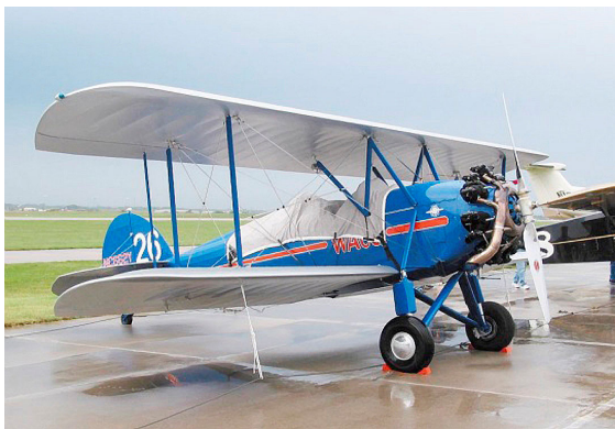
Waco ASO Canopy Cover