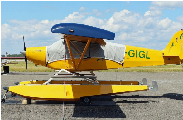
Wag Aero Sportsman 2+2 Canopy Cover

This cover type is made from Silver Acrylic Sunbrella canvas and is 100% lined with a soft and smooth microfiber. Bruce's Custom Covers developed this material combination especially for aircraft protection. The outer material is medium weight and treated for water resistance, UV resistance and anti-static buildup. The inner lining is a very soft and smooth microfiber to prevent scratching. The material is very reflective, and tests show that the cabin interior temperature can be reduced to near-ambient temperature on the hottest of days. It is water, ice and snow repellent, yet breathable to allow moisture to escape from between the cover and the aircraft surface.