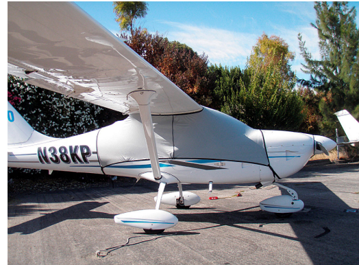
Glstar Spandex FlyAway Travel Canopy Cover