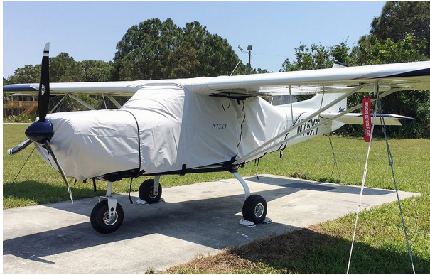
World Aircraft Extended Canopy Cover & Engine Cover

This cover type is made from Silver Acrylic Sunbrella canvas and is 100% lined with a soft and smooth microfiber. Bruce's Custom Covers developed this material combination especially for aircraft protection. The outer material is medium weight and treated for water resistance, UV resistance and anti-static buildup. The inner lining is a very soft and smooth microfiber to prevent scratching. The material is very reflective, and tests show that the cabin interior temperature can be reduced to near-ambient temperature on the hottest of days. It is water, ice and snow repellent, yet breathable to allow moisture to escape from between the cover and the aircraft surface.