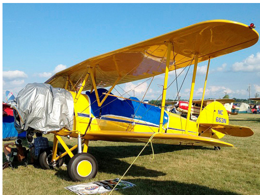
Waco 10 Canopy Cover