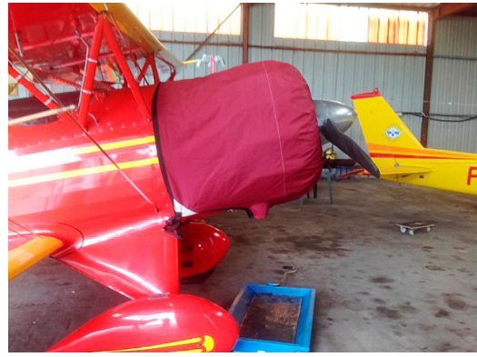
Waco Engine Cover