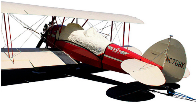
Waco 10 Canopy Cover