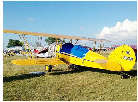
Waco 10 Canopy Cover