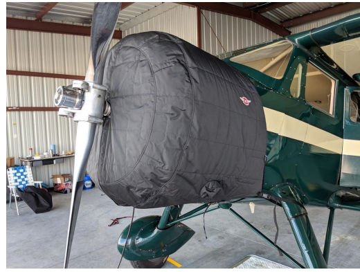
Wacon Cabin Biplane ZQC-6 Insulated Engine Cover