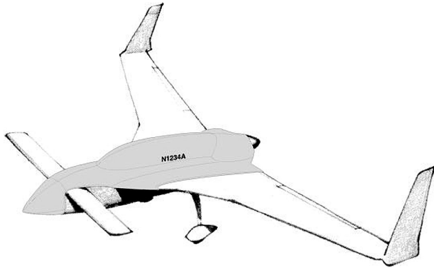
Rutan Long-EZ Canopy Cover