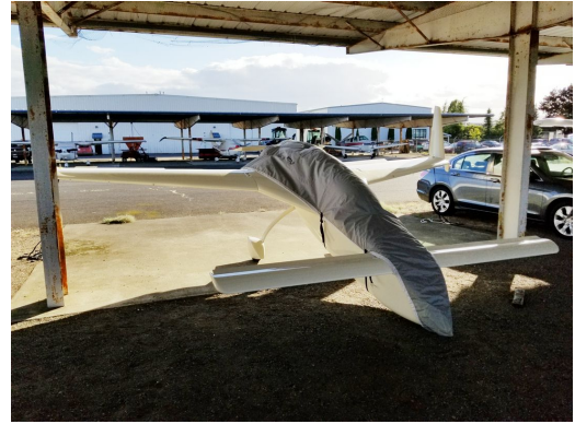
Rutan Vari EZ Travel Cover/Nose/Engine Cover