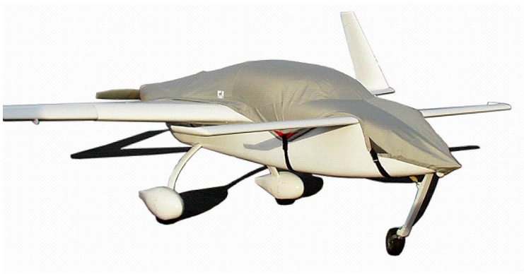
Cozy III Canopy/Nose/Engine Cover