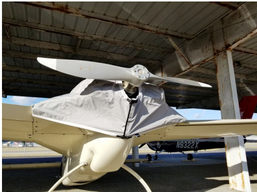
Rutan Vari EZ Travel Cover/Nose/Engine Cover