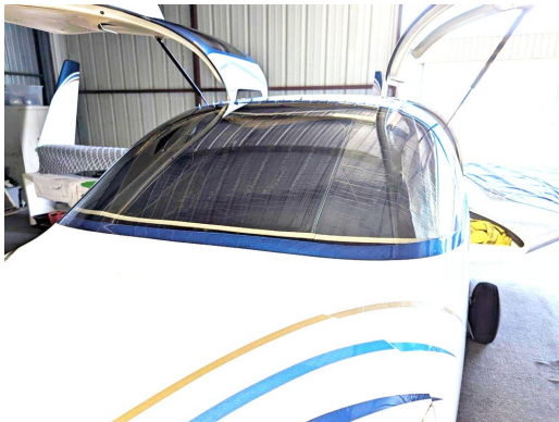
Velocity Windshield HeartShield

Heatshields are interior sunshades for an aircraft's windows or canopy glass. The product is a unique composite of closed-cell foam with a silver mylar finish. The semi-rigid design is stiff enough to stand along the inside of the windshield using sun visors or window framing. It folds up flat and easily stores in the included storage sleeve. Some designs may require velcro and suction cups. A Heatshield is an excellent short-term remedy for cockpit overheating.