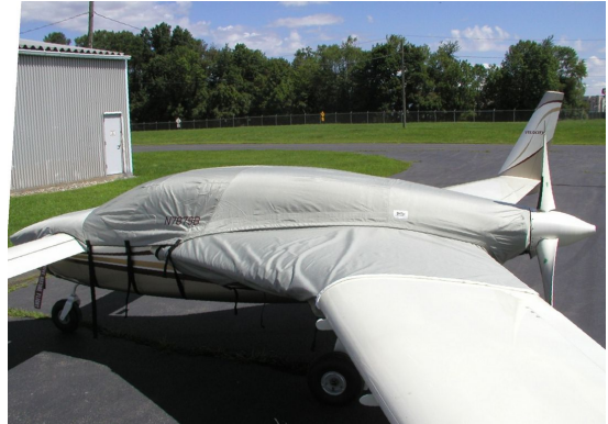
Velocity Canopy/Engine/Nose with Abbreviated Wing Covers