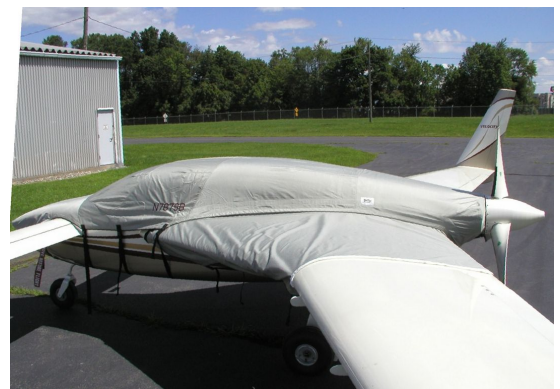
Velocity Canopy/Engine/Nose with Abbreviated Wing Covers