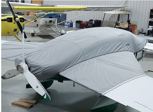
Velocity Canopy/Nose/Engine Cover, wing coverage varies

WINTER USE MATERIAL - Made with Solution-Dyed Polyester fabric, this option is intended for seasonal use to aid in deicing, rain mitigation, or for occasional travel. The material is lighter and more compact, but more susceptible to UV damage and may have a shorter useful life if used continuously outside than the all-year use material.