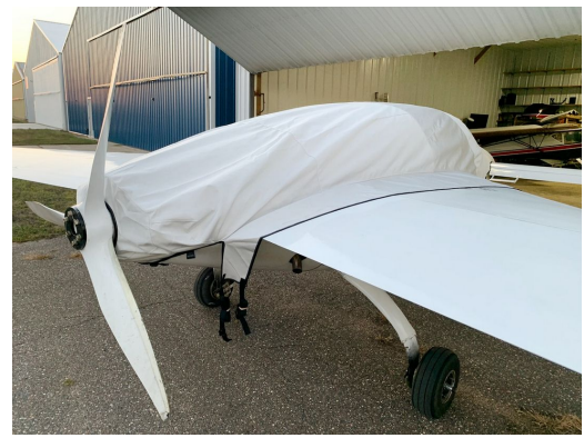
Velocity Canopy/Nose/Engine Cover