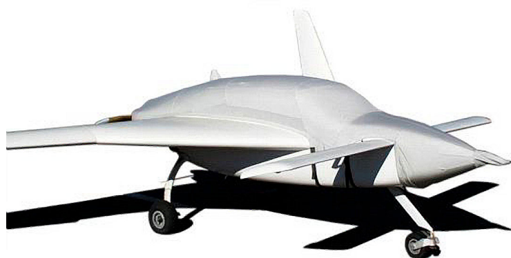
Velocity Canopy/Nose/Engine Cover