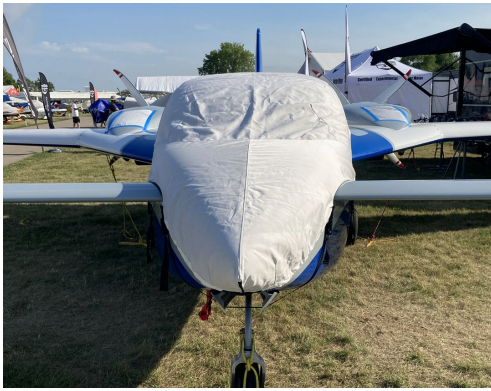
Twin Velocity Canopy/Nose Cover