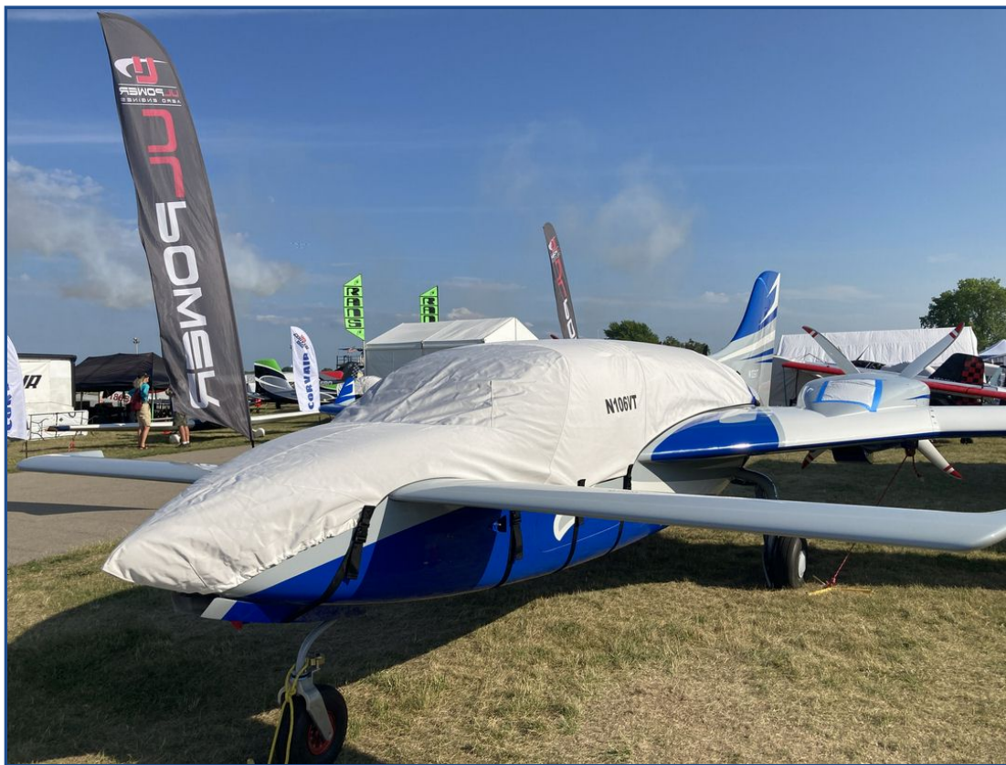
Twin Velocity Canopy/Nose Cover