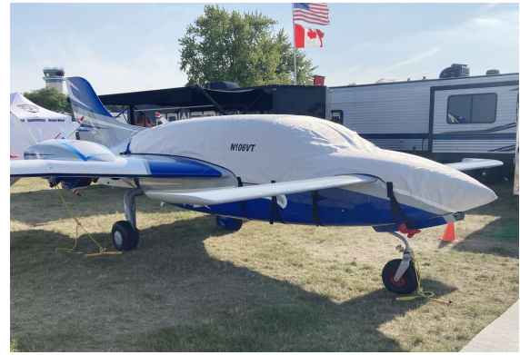
Twin Velocity Canopy/Nose Cover