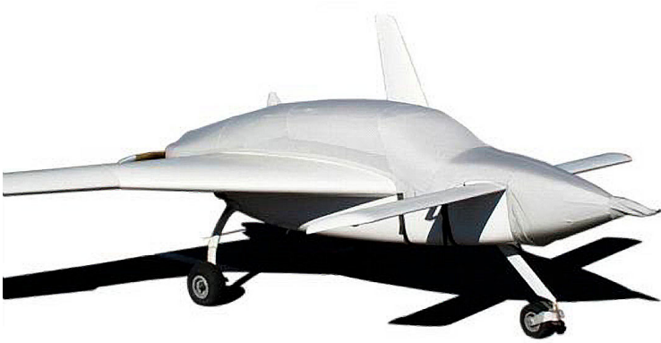
Velocity Canopy/Nose/Engine Cover

Travel Covers are made with Silver Solution-Dyed Polyester fabric and only lined over the windshield to save weight. The material is lightweight and more compact for easy stowage in the aircraft. The polyester material is water resistant, but only intended for occasional use outside. We also have an ultra lightweight material available for fitted hangar dust covers. For daily outdoor use, the non-travel Sunbrella Cover is the best choice.