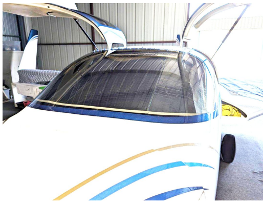
Velocity Windshield HeartShield