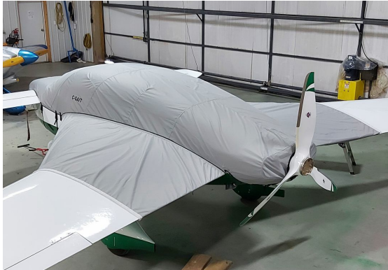
Velocity Canopy/Nose/Engine Cover, wing coverage varies

WINTER USE MATERIAL - Made with Solution-Dyed Polyester fabric, this option is intended for seasonal use to aid in deicing, rain mitigation, or for occasional travel. The material is lighter and more compact, but more susceptible to UV damage and may have a shorter useful life if used continuously outside than the all-year use material.