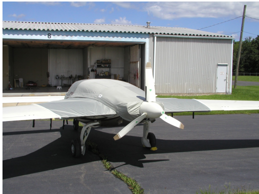
Velocity Canopy/Engine/Nose with Abbreviated Wing Covers

shorter useful life if used continuously outside than the all-year use material.