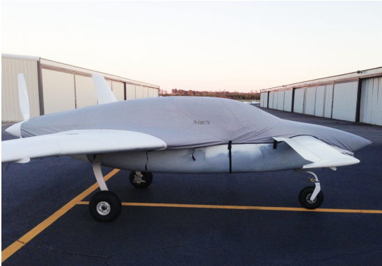
Velocity Travel Weight Canopy/Nose/Engine Cover, XI Model