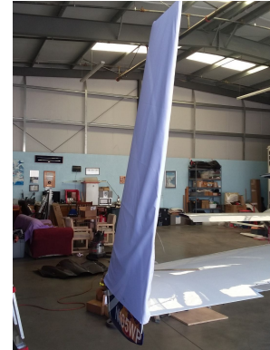
Velocity Vertical Stabilizer Covers, test fit cover