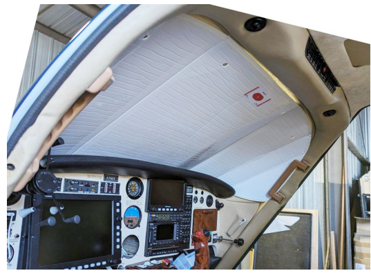
Velocity Windshield HeartShield