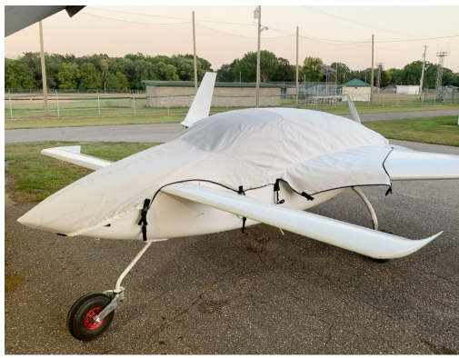
Velocity Canopy/Nose/Engine Cover