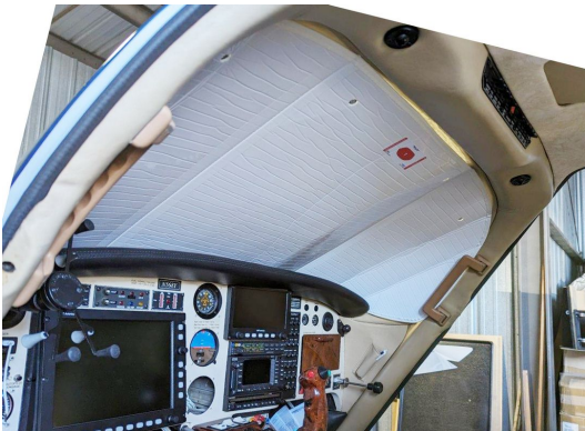
Velocity Windshield HeartShield