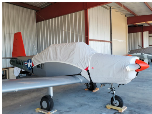
Varga Kachina Canopy & Engine Covers