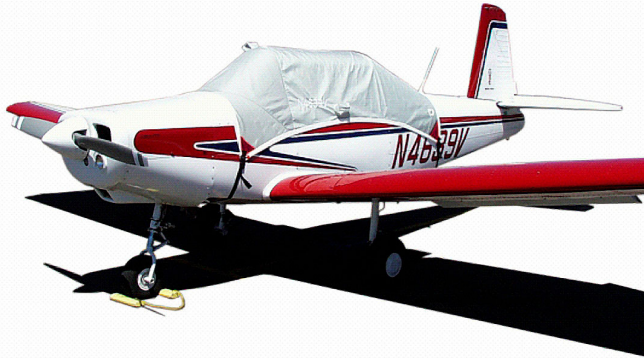
Canopy Cover for the Varga Kachina

This cover type is made from Silver Acrylic Sunbrella canvas and is 100% lined with a soft and smooth microfiber. Bruce's Custom Covers developed this material combination especially for aircraft protection. The outer material is medium weight and treated for water resistance, UV resistance and anti-static buildup. The inner lining is a very soft and smooth microfiber to prevent scratching. The material is very reflective, and tests show that the cabin interior temperature can be reduced to near-ambient temperature on the hottest of days. It is water, ice and snow repellent, yet breathable to allow moisture to escape from between the cover and the aircraft surface.