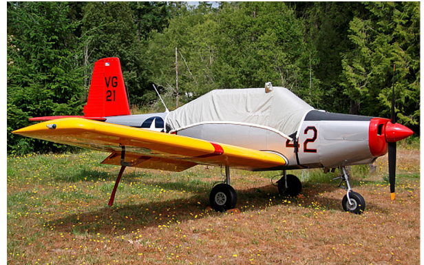
Varga Kachina Canopy Cover