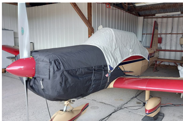
Varga 2150A Insulated Engine Cover, Canopy Cover

This cover type is made from Silver Acrylic Sunbrella canvas and is 100% lined with a soft and smooth microfiber. Bruce's Custom Covers developed this material combination especially for aircraft protection. The outer material is medium weight and treated for water resistance, UV resistance and anti-static buildup. The inner lining is a very soft and smooth microfiber to prevent scratching. The material is very reflective, and tests show that the cabin interior temperature can be reduced to near-ambient temperature on the hottest of days. It is water, ice and snow repellent, yet breathable to allow moisture to escape from between the cover and the aircraft surface.