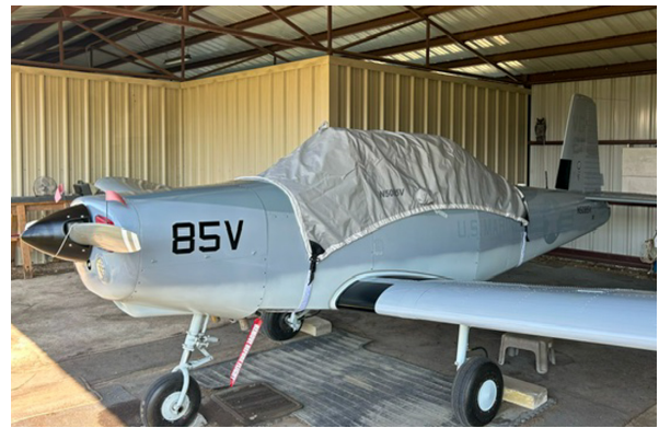
Varga Kachina Travel Cover, Light Weight Canopy Cover