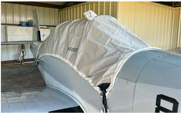
Varga Kachina Travel Cover, Light Weight Canopy Cover

Travel Covers are made with Silver Solution-Dyed Polyester fabric and only lined over the windshield to save weight. The material is lightweight and more compact for easy stowage in the aircraft. The polyester material is water resistant, but only intended for occasional use outside. We also have an ultra lightweight material available for fitted hangar dust covers. For daily outdoor use, the non-travel Sunbrella Cover is the best choice.