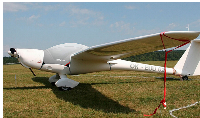
Lambda Canopy Cover (illustration)