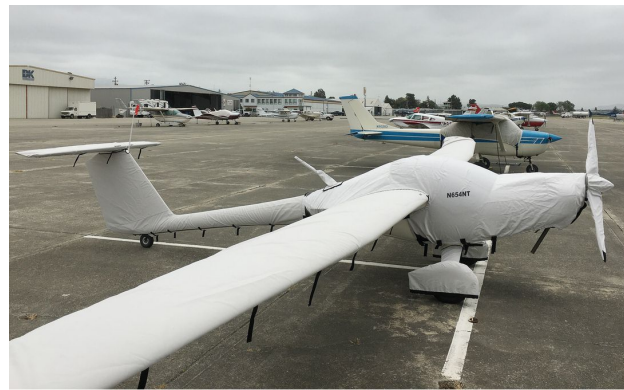
Lambda Canopy/Engine Cover and Wing Covers Distaer Sundancer LSA Extended Canopy/Engine, Prop, Wheelpants, Wings & Empennage Covers