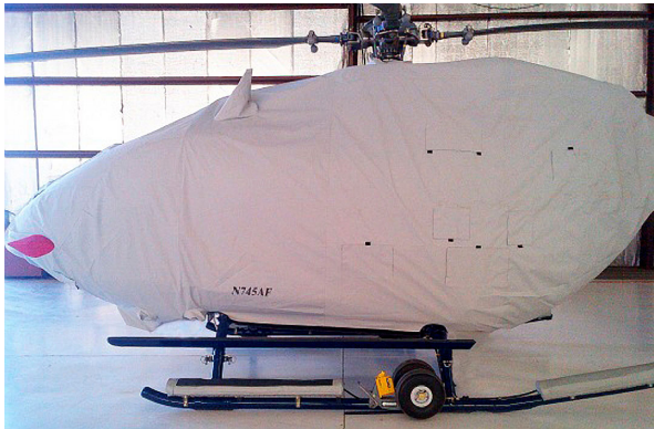
Eurocopter EC-145 Main Body Cover, also covers the bottom belly

Covers developed this material combination especially for aircraft protection. The outer material is medium weight and treated for water resistance, UV resistance and anti-static buildup. The inner lining is a very soft and smooth microfiber to prevent scratching. The material is very reflective, and tests show that the cabin interior temperature can be reduced to near-ambient temperature on the hottest of days. It is water, ice and snow repellent, yet breathable to allow moisture to escape from between the cover and the aircraft surface.