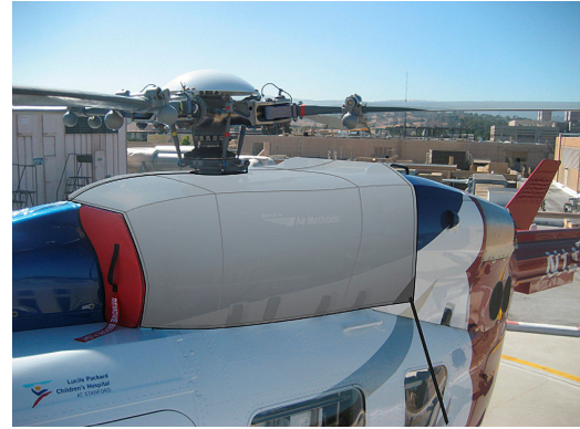
Bubble Cover w/ nose mounted radome, Upper Deck Plugs/Cover Upper Deck Plugs/Cover, extended to cover aft intake vents