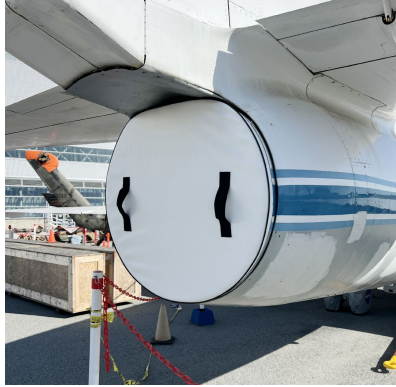
Lockheed U-2 Exhaust Plug, test fit plug

This cover type is made from Silver Acrylic Sunbrella canvas and is 100% lined with a soft and smooth microfiber. Bruce's Custom Covers developed this material combination especially for aircraft protection. The outer material is medium weight and treated for water resistance, UV resistance and anti-static buildup. The inner lining is a very soft and smooth microfiber to prevent scratching. The material is very reflective, and tests show that the cabin interior temperature can be reduced to near-ambient temperature on the hottest of days. It is water, ice and snow repellent, yet breathable to allow moisture to escape from between the cover and the aircraft surface.