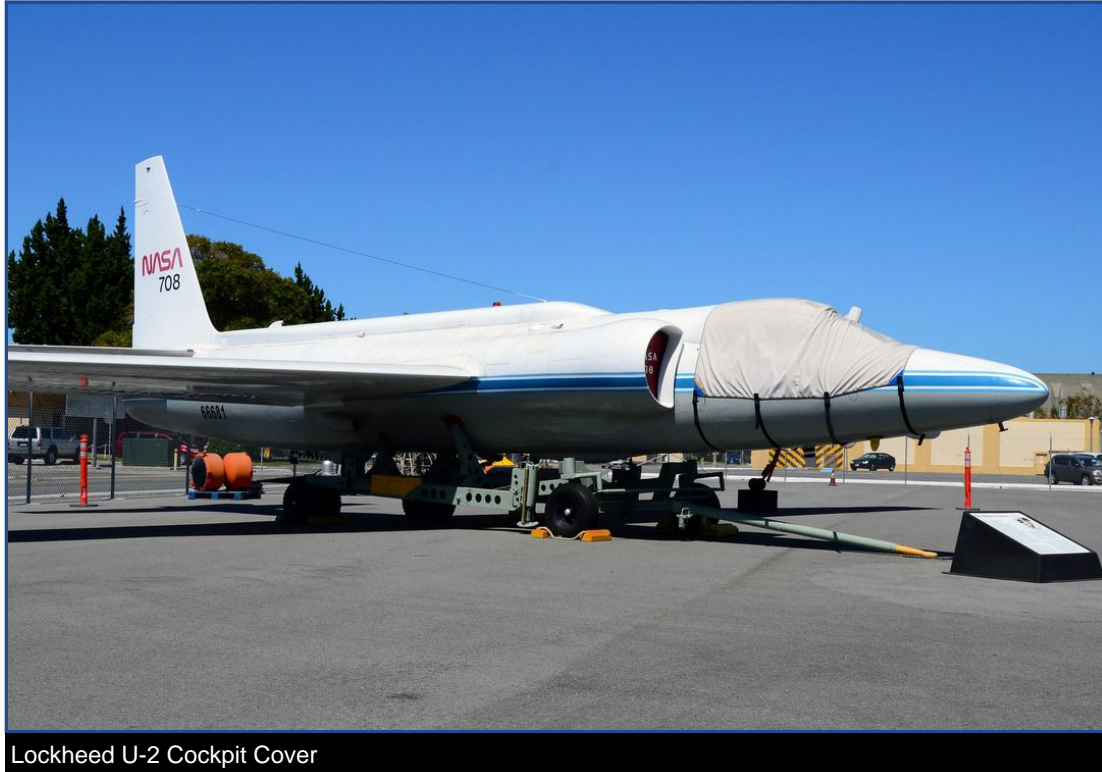
Lockheed U-2 Cockpit Cover