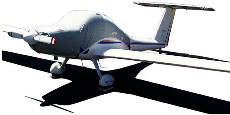
Grob 109 Canopy/Engine Cover & Horiz. Stabilizer Cover

WINTER USE MATERIAL - Made with Solution-Dyed Polyester fabric, this option is intended for seasonal use to aid in deicing, rain mitigation, or for occasional travel. The material is lighter and more compact, but more susceptible to UV damage and may have a shorter useful life if used continuously outside than the all-year use material.