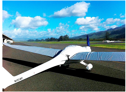
Lambda Canopy/Engine Cover and Wing Covers