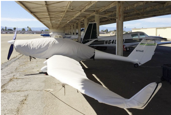
Phoenix Air U-15 Canopy/Engine, Wing & Horizontal Stabilizer Covers

WINTER USE MATERIAL - Made with Solution-Dyed Polyester fabric, this option is intended for seasonal use to aid in deicing, rain mitigation, or for occasional travel. The material is lighter and more compact, but more susceptible to UV damage and may have a shorter useful life if used continuously outside than the all-year use material.