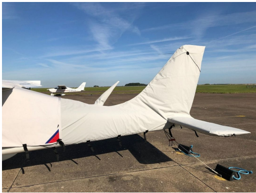
Tecnam P2008 Empennage Cover (Tailboom, Vertical & Horiz Stabilizers), All Year Use

WINTER USE MATERIAL - Made with Solution-Dyed Polyester fabric, this option is intended for seasonal use to aid in deicing, rain mitigation, or for occasional travel. The material is lighter and more compact, but more susceptible to UV damage and may have a shorter useful life if used continuously outside than the all-year use material.