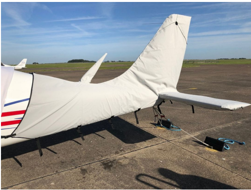
Tecnam P2008 Empennage Cover (Tailboom, Vertical & Horiz Stabilizers), All Year Use