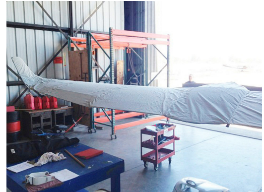
Tecnam Twin Wing/Engine Covers