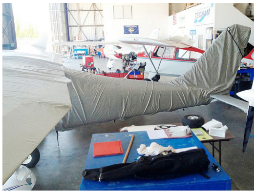
Tecnam Twin Wing & Empennage Covers