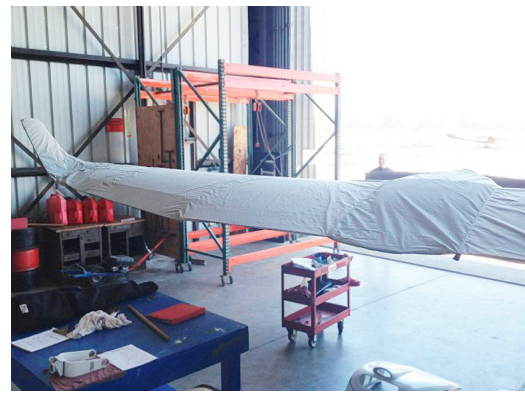
Tecnam Twin Wing/Engine Covers