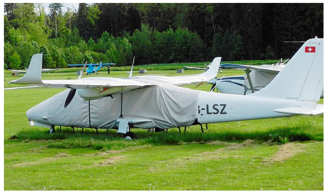
Tecnam Twin Extended Canopy/Nose Cover