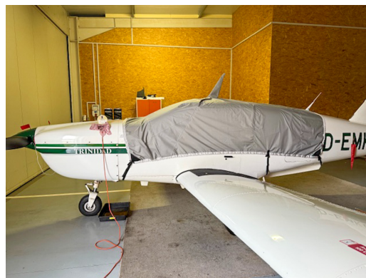
Trinidad TB20 Travel Cover, Light Weight Canopy Cover