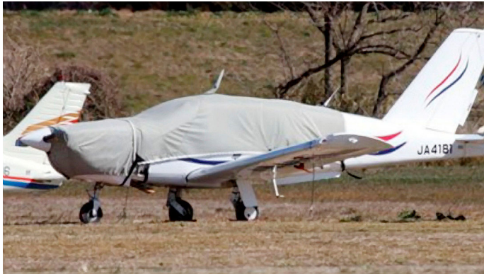
Canopy & Engine Covers