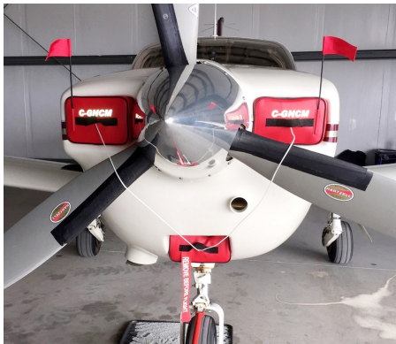
Socata TB-20 Engine Plugs, set of 3

Engine Inlet Plugs are custom fit for your Socata Tampico, Tobago & Trinidad intakes, made with heavy-duty vinyl material, and stuffed with a single block of sculpted urethane foam. Each plug has a zipper that allows the foam to be removed and dried if necessary. Engine plugs have warning flags that are visible from the cockpit or 'remove before flight' streamers sewn onto the face of the plugs. Most plugs are imprinted with the aircraft registration number in black for an extra charge. Storage bag NOT included. Engine plugs may be inserted after flight when the engine is still warm. Engine Inlet Plugs are commonly referred to as Cowl Plugs, Intake Plugs, Cowl Blocks, Engine Blocks, and Engine Bungs.