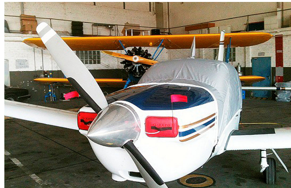
Socata TB20 Canopy Cover and Engine Inlet Plugs