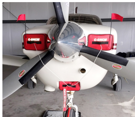
Socata TB-20 Engine Plugs, set of 3