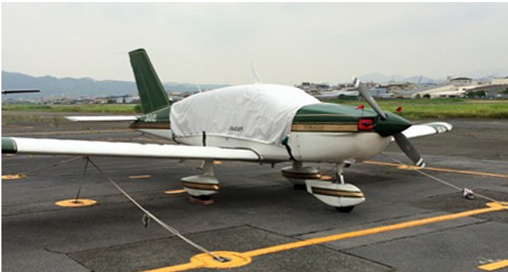
Socata TB-20 Canopy Cover