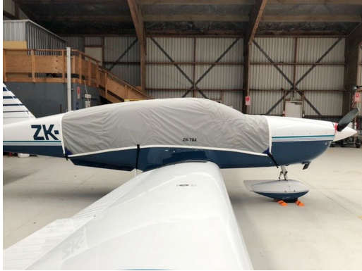
Socata TB-9 TRAVEL COVER, Light Weight Canopy Cover

Travel Covers are made with Silver Solution-Dyed Polyester fabric and only lined over the windshield to save weight. The material is lightweight and more compact for easy stowage in the aircraft. The polyester material is water resistant, but only intended for occasional use outside. We also have an ultra lightweight material available for fitted hangar dust covers. For daily outdoor use, the non-travel Sunbrella Cover is the best choice.