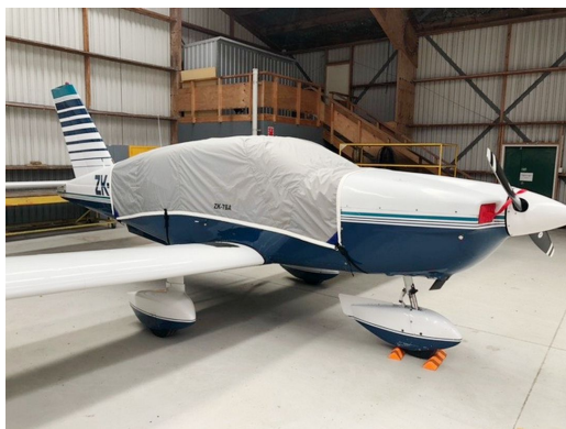
Socata TB-9 TRAVEL COVER, Light Weight Canopy Cover

Travel Covers are made with Silver Solution-Dyed Polyester fabric and only lined over the windshield to save weight. The material is lightweight and more compact for easy stowage in the aircraft. The polyester material is water resistant, but only intended for occasional use outside. We also have an ultra lightweight material available for fitted hangar dust covers. For daily outdoor use, the non-travel Sunbrella Cover is the best choice.