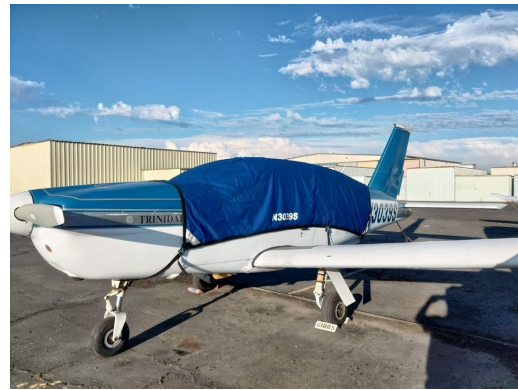
Socata TB-20 Trinidad Canopy Cover, Custom Color Upgrade