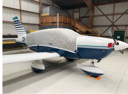
Socata TB-9 TRAVEL COVER, Light Weight Canopy Cover