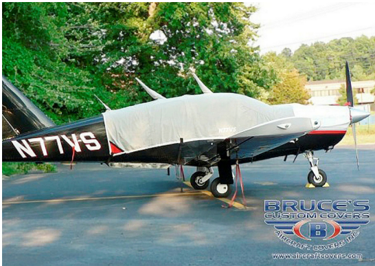
Socata TB20 Canopy Cover

This cover type is made from Silver Acrylic Sunbrella canvas and is 100% lined with a soft and smooth microfiber. Bruce's Custom Covers developed this material combination especially for aircraft protection. The outer material is medium weight and treated for water resistance, UV resistance and anti-static buildup. The inner lining is a very soft and smooth microfiber to prevent scratching. The material is very reflective, and tests show that the cabin interior temperature can be reduced to near-ambient temperature on the hottest of days. It is water, ice and snow repellent, yet breathable to allow moisture to escape from between the cover and the aircraft surface.