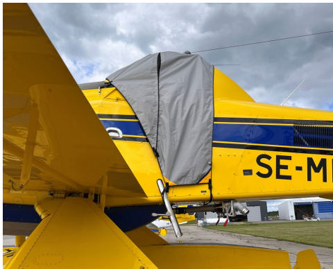
Air Tractor Light Weight Canopy Cover

This cover type is made from Silver Acrylic Sunbrella canvas and is 100% lined with a soft and smooth microfiber. Bruce's Custom Covers developed this material combination especially for aircraft protection. The outer material is medium weight and treated for water resistance, UV resistance and anti-static buildup. The inner lining is a very soft and smooth microfiber to prevent scratching. The material is very reflective, and tests show that the cabin interior temperature can be reduced to near-ambient temperature on the hottest of days. It is water, ice and snow repellent, yet breathable to allow moisture to escape from between the cover and the aircraft surface.