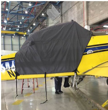
Air Tractor AT-802F Canopy Cover

Travel Covers are made with Silver Solution-Dyed Polyester fabric and only lined over the windshield to save weight. The material is lightweight and more compact for easy stowage in the aircraft. The polyester material is water resistant, but only intended for occasional use outside. We also have an ultra lightweight material available for fitted hangar dust covers. For daily outdoor use, the non-travel Sunbrella Cover is the best choice.