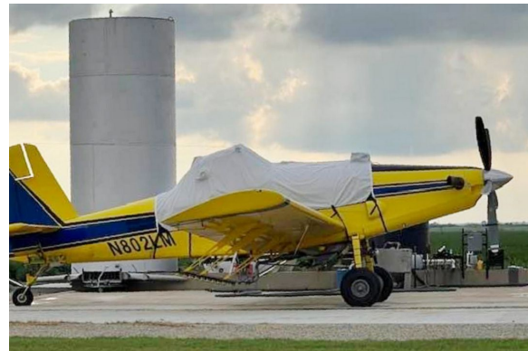
Air Tractor Inc AT-802A Canopy/Hopper Cover