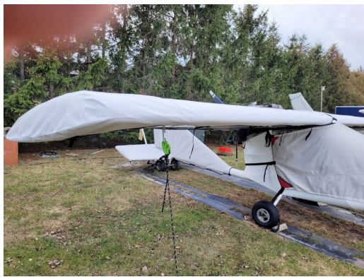
Titan Tornado Canopy/Nose, Wings & Empennage Cover