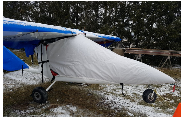
Titan Tornado Canopy/Nose Cover