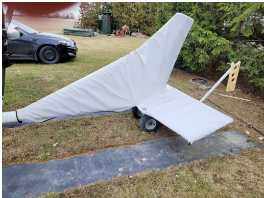
Titan Tornado Empennage Cover

WINTER USE MATERIAL - Made with Solution-Dyed Polyester fabric, this option is intended for seasonal use to aid in deicing, rain mitigation, or for occasional travel. The material is lighter and more compact, but more susceptible to UV damage and may have a shorter useful life if used continuously outside than the all-year use material.