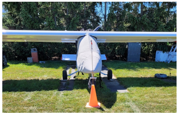
Titan Tornado Canopy/Nose Cover