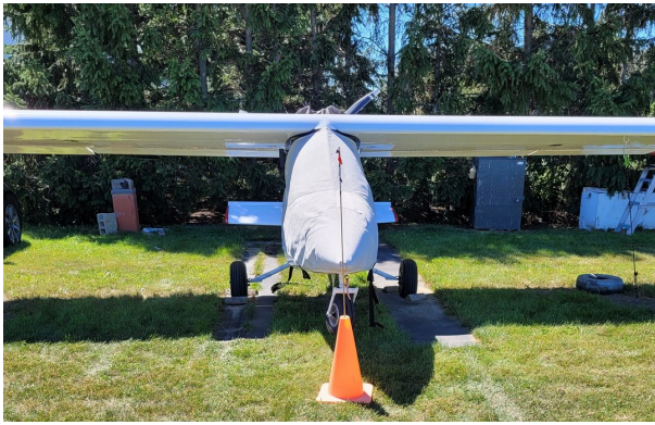
Titan Tornado Canopy/Nose Cover