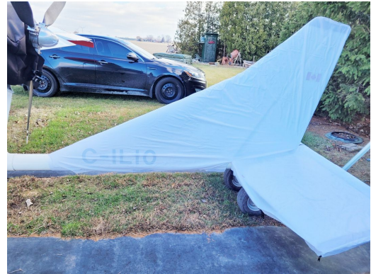
Titan Tornado Empennage Cover, test fit cover