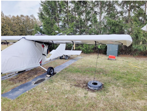
Titan Tornado Canopy/Nose, Wings & Empennage Cover

WINTER USE MATERIAL - Made with Solution-Dyed Polyester fabric, this option is intended for seasonal use to aid in deicing, rain mitigation, or for occasional travel. The material is lighter and more compact, but more susceptible to UV damage and may have a shorter useful life if used continuously outside than the all-year use material.