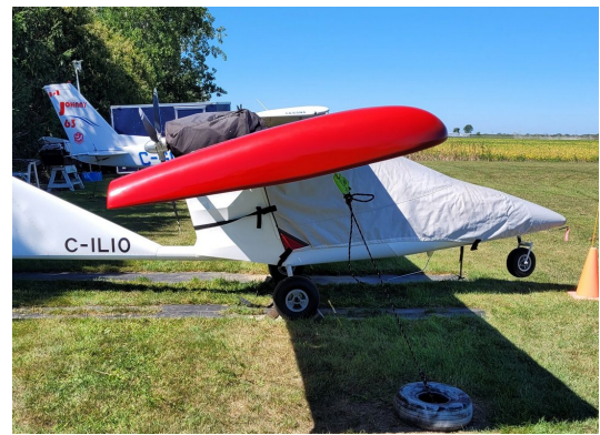
Titan Tornado Canopy/Nose Cover