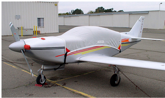
Glasair II/III Canopy Cover & Plugs