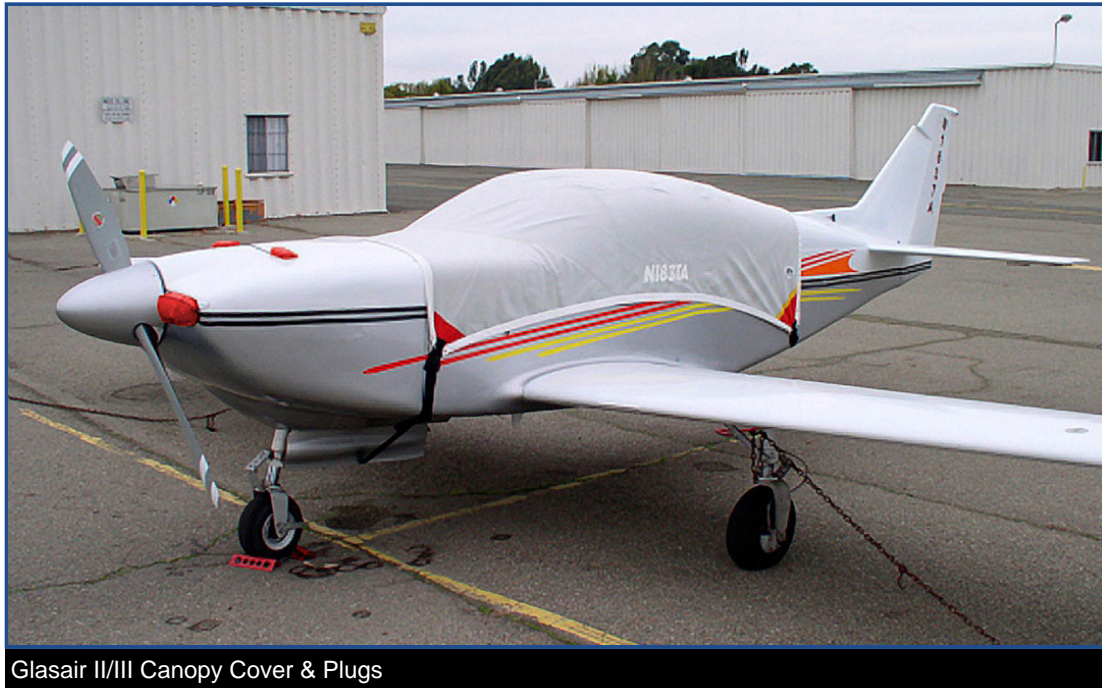
Glasair II/III Canopy Cover & Plugs