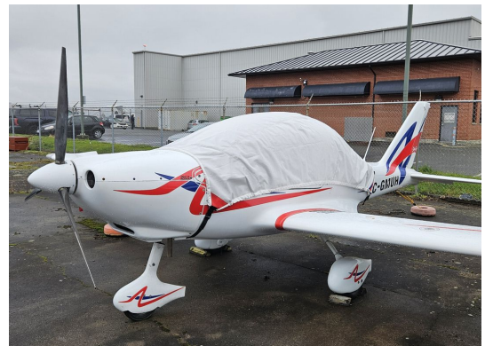
TL 2000 Sting Sport Canopy Cover