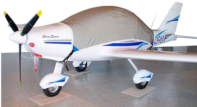
Sting Sport Canopy Cover & Engine Plugs

This cover type is made from Silver Acrylic Sunbrella canvas and is 100% lined with a soft and smooth microfiber. Bruce's Custom Covers developed this material combination especially for aircraft protection. The outer material is medium weight and treated for water resistance, UV resistance and anti-static buildup. The inner lining is a very soft and smooth microfiber to prevent scratching. The material is very reflective, and tests show that the cabin interior temperature can be reduced to near-ambient temperature on the hottest of days. It is water, ice and snow repellent, yet breathable to allow moisture to escape from between the cover and the aircraft surface.