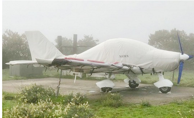
TL Sting Sport Full Cover Set

WINTER USE MATERIAL - Made with Solution-Dyed Polyester fabric, this option is intended for seasonal use to aid in deicing, rain mitigation, or for occasional travel. The material is lighter and more compact, but more susceptible to UV damage and may have a shorter useful life if used continuously outside than the all-year use material.