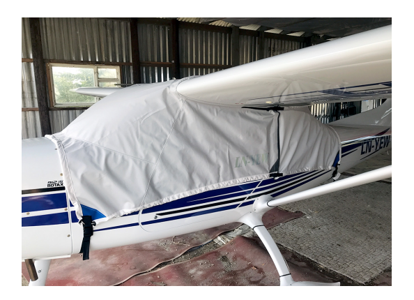
TL Ultralight Sirius TL-3000 Canopy Cover (Over-The-Top Style)