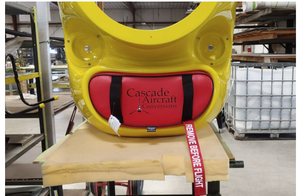
Thrush Intake Plug (Cascade Conversion)