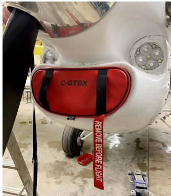
Ayres Thrush Intake Plug (Cascade Conversion)

Engine Inlet Plugs are custom fit for your Ayres Thrush intakes, made with heavy-duty vinyl material, and stuffed with a single block of sculpted urethane foam. Each plug has a zipper that allows the foam to be removed and dried if necessary. Engine plugs have warning flags that are visible from the cockpit or 'remove before flight' streamers sewn onto the face of the plugs. Most plugs are imprinted with the aircraft registration number in black for an extra charge. Storage bag NOT included. Engine plugs may be inserted after flight when the engine is still warm. Engine Inlet Plugs are commonly referred to as Cowl Plugs, Intake Plugs, Cowl Blocks, Engine Blocks, and Engine Bungs.