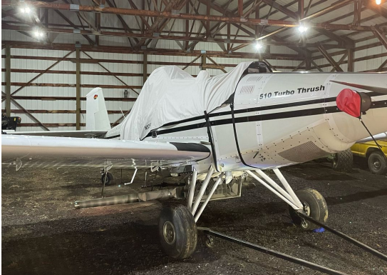
Thrush Aircraft S2R-T34 Canopy Cover, & Prop Tie/Exhaust Covers

This cover type is made from Silver Acrylic Sunbrella canvas and is 100% lined with a soft and smooth microfiber. Bruce's Custom Covers developed this material combination especially for aircraft protection. The outer material is medium weight and treated for water resistance, UV resistance and anti-static buildup. The inner lining is a very soft and smooth microfiber to prevent scratching. The material is very reflective, and tests show that the cabin interior temperature can be reduced to near-ambient temperature on the hottest of days. It is water, ice and snow repellent, yet breathable to allow moisture to escape from between the cover and the aircraft surface.