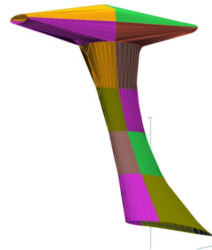
Autogyro Calidus Rotor Mast Cover, 3D model