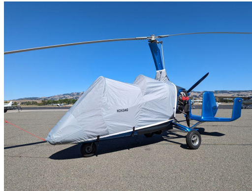
Autogyro MTOSPORT Travel Cover, Light Weight Canopy/Nose Cover