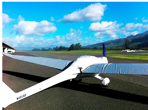
Lambda Canopy/Engine Cover and Wing Covers