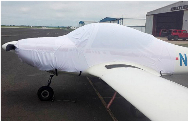
Taifun 17E Canopy/Engine Cover, test fit cover