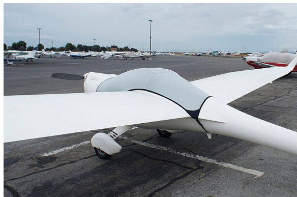
Lambda Canopy/Engine Cover and Wing Covers