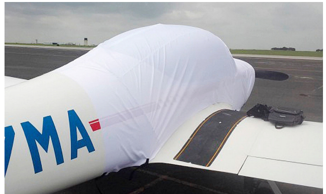
Taifun 17E Canopy/Engine Cover, test fit cover