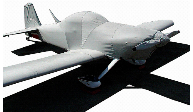
Van's RV-4 Complete Cover