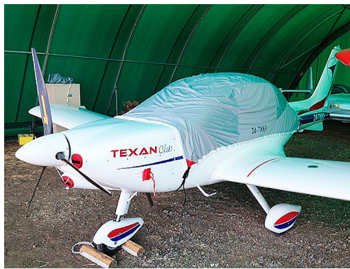
Texan Club Sport 550 Lightweight Travel Cover and Engine Inlet Plugs set