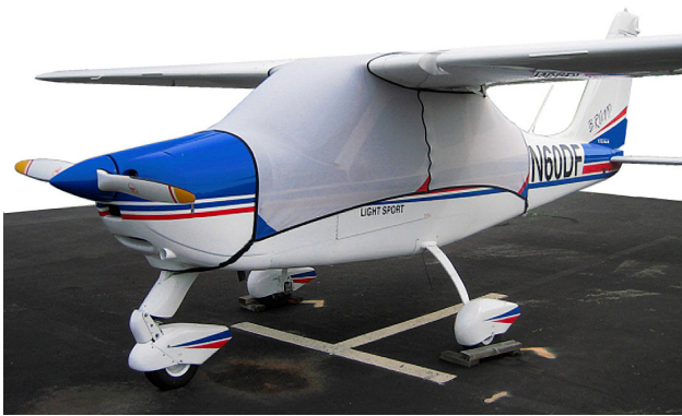
Tecnam Bravo Spandex FlyAway Travel Canopy Cover

The material is very reflective, and tests show that the cabin interior temperature can be reduced to near-ambient temperature on the hottest of days. It is water, ice and snow repellent, yet breathable to allow moisture to escape from between the cover and the aircraft surface.