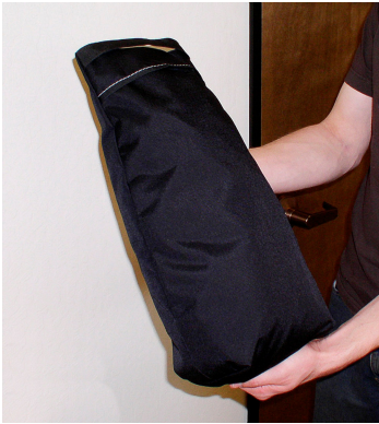
Light Weight Travel-Cover Mini-Storage Bag: 18" x 6" x 4"