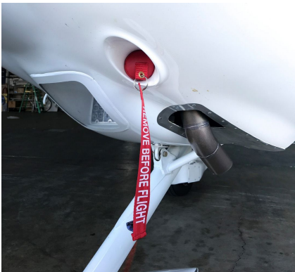
Tecnam Engine Plugs, set of 5

Engine Inlet Plugs are custom fit for your Tecnam P92 Eaglet intakes, made with heavy-duty vinyl material, and stuffed with a single block of sculpted urethane foam. Each plug has a zipper that allows the foam to be removed and dried if necessary. Engine plugs have warning flags that are visible from the cockpit or 'remove before flight' streamers sewn onto the face of the plugs. Most plugs are imprinted with the aircraft registration number in black for an extra charge. Storage bag NOT included. Engine plugs may be inserted after flight when the engine is still warm. Engine Inlet Plugs are commonly referred to as Cowl Plugs, Intake Plugs, Cowl Blocks, Engine Blocks, and Engine Bungs.