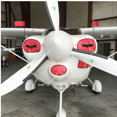
Tecnam P2010 Engine Plugs