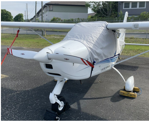
Tecnam P92 EAGLET Canopy Cover Over theTop Style

occasional use outside. We also have an ultra lightweight material available for fitted hangar dust covers. For daily outdoor use, the non-travel Sunbrella Cover is the best choice.