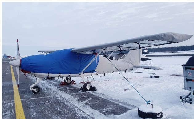
Tecnam P2010 Wing, Empennage & Prop Covers

This cover type is made from Silver Acrylic Sunbrella canvas and is 100% lined with a soft and smooth microfiber. Bruce's Custom Covers developed this material combination especially for aircraft protection. The outer material is medium weight and treated for water resistance, UV resistance and anti-static buildup. The inner lining is a very soft and smooth microfiber to prevent scratching. The material is very reflective, and tests show that the cabin interior temperature can be reduced to near-ambient temperature on the hottest of days. It is water, ice and snow repellent, yet breathable to allow moisture to escape from between the cover and the aircraft surface.