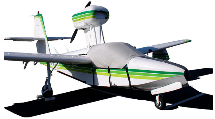
Lake LA-250 Canopy Cover