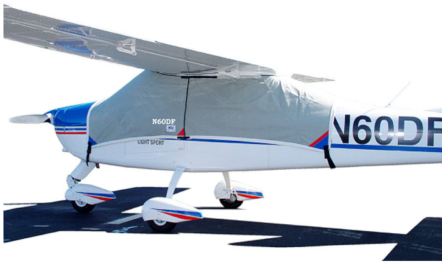
Tecnam Bravo Canopy Cover