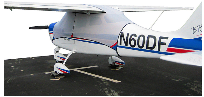
Tecnam Bravo Spandex FlyAway Travel Canopy Cover