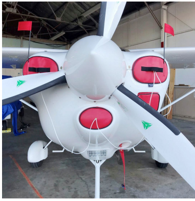
Tecnam Engine Plugs, set of 5