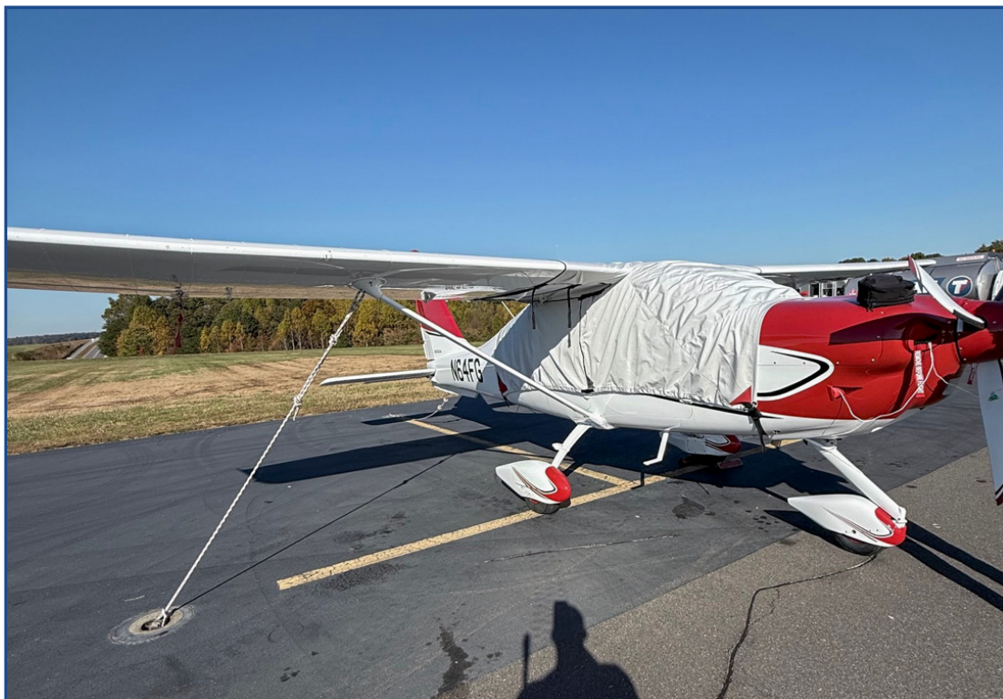
Costruzioni Aeronautiche Tecna P2010 TDI Canopy Cover, over-top-type