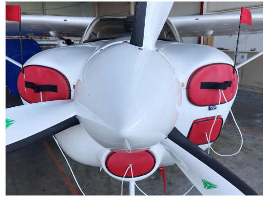
Tecnam Engine Plugs, set of 5