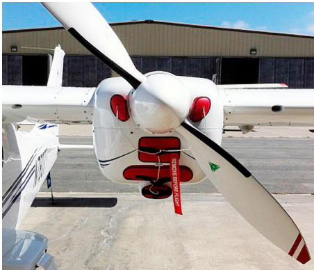
Tecnam P2006T Engine Plugs

Engine Inlet Plugs are custom fit for your Tecnam P2006T Twin intakes, made with heavy-duty vinyl material, and stuffed with a single block of sculpted urethane foam. Each plug has a zipper that allows the foam to be removed and dried if necessary. Engine plugs have warning flags that are visible from the cockpit or 'remove before flight' streamers sewn onto the face of the plugs. Most plugs are imprinted with the aircraft registration number in black for an extra charge. Storage bag NOT included. Engine plugs may be inserted after flight when the engine is still warm. Engine Inlet Plugs are commonly referred to as Cowl Plugs, Intake Plugs, Cowl Blocks, Engine Blocks, and Engine Bunges.