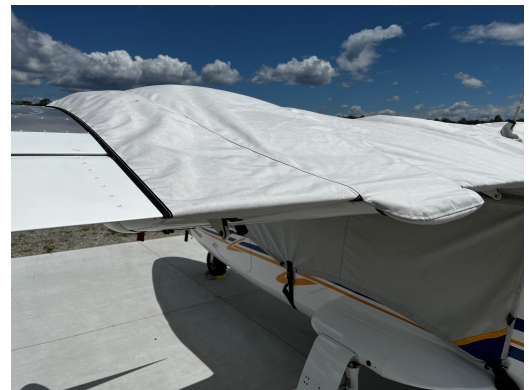
Tecnam P2006T Twin Wing & Engine Covers, All Year Use