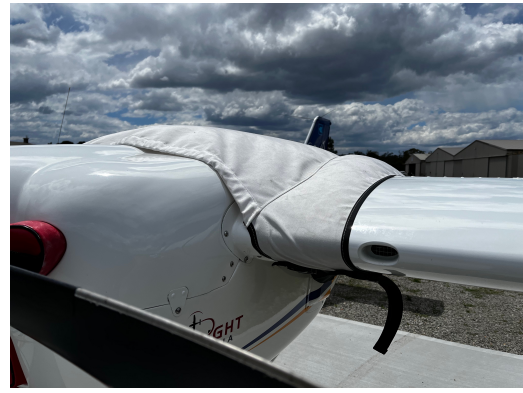
Tecnam P2006T Twin Wing & Engine Covers, All Year Use