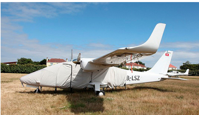
Tecnam Twin Extended Canopy/Nose Cover

This cover type is made from Silver Acrylic Sunbrella canvas and is 100% lined with a soft and smooth microfiber. Bruce's Custom Covers developed this material combination especially for aircraft protection. The outer material is medium weight and treated for water resistance, UV resistance and anti-static buildup. The inner lining is a very soft and smooth microfiber to prevent scratching. The material is very reflective, silver cover, and tests show that the cabin interior temperature can be reduced to near-ambient temperature on the hottest of days. It is water, ice and snow repellent, yet breathable to allow moisture to escape from between the cover and the aircraft surface.