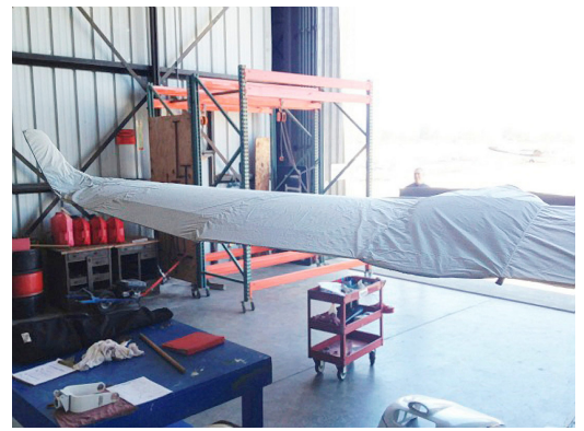
Tecnam Twin Wing/Engine Covers