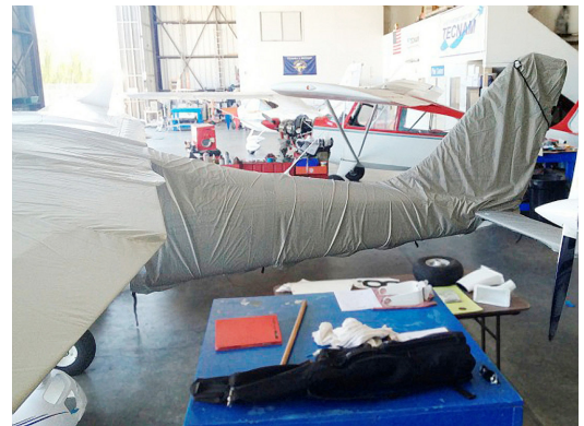
Tecnam Twin Wing & Empennage Covers