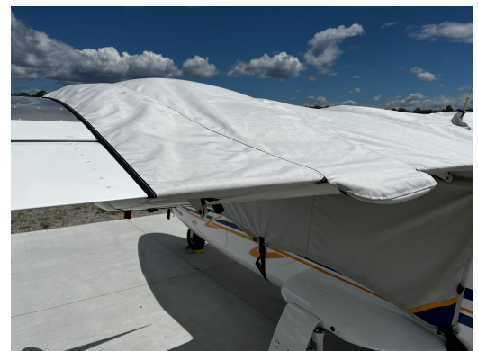
Tecnam P2006T Twin Wing & Engine Covers, All Year Use