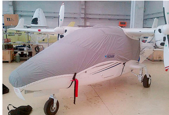
Tecnam P2006T Twin Lightweight Travel Canopy/Nose Cover

Travel Covers are made with Silver Solution-Dyed Polyester fabric and only lined over the windshield to save weight. The material is lightweight and more compact for easy stowage in the aircraft. The polyester material is water resistant, but only intended for occasional use outside. We also have an ultra lightweight material available for fitted hangar dust covers. For daily outdoor use, the non-travel Sunbrella Cover is the best choice.