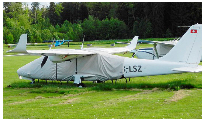
Tecnam Twin Extended Canopy/Nose Cover