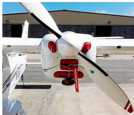
Tecnam P2006T Engine Plugs

Engine Inlet Plugs are custom fit for your Tecnam P2006T Twin intakes, made with heavy-duty vinyl material, and stuffed with a single block of sculpted urethane foam. Each plug has a zipper that allows the foam to be removed and dried if necessary. Engine plugs have warning flags that are visible from the cockpit or 'remove before flight' streamers sewn onto the face of the plugs. Most plugs are imprinted with the aircraft registration number in black for an extra charge. Storage bag NOT included. Engine plugs may be inserted after flight when the engine is still warm. Engine Inlet Plugs are commonly referred to as Cowl Plugs, Intake Plugs, Cowl Blocks, Engine Blocks, and Engine Bungs.