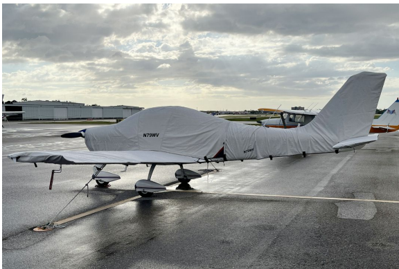
Tecnam P2002 Sierra Complete Cover Set

WINTER USE MATERIAL - Made with Solution-Dyed Polyester fabric, this option is intended for seasonal use to aid in deicing, rain mitigation, or for occasional travel. The material is lighter and more compact, but more susceptible to UV damage and may have a shorter useful life if used continuously outside than the all-year use material.