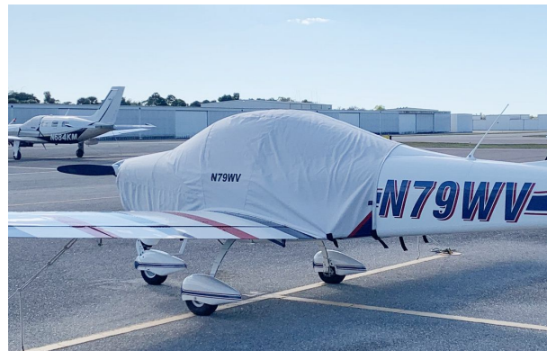
Tecnam Sierra Extended Canopy/Engine Cover