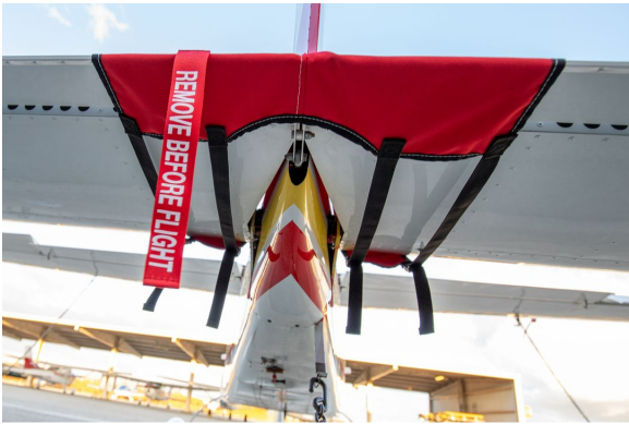
Tecnam Bravo Tailcone Cover

WINTER USE MATERIAL - Made with Solution-Dyed Polyester fabric, this option is intended for seasonal use to aid in deicing, rain mitigation, or for occasional travel. The material is lighter and more compact, but more susceptible to UV damage and may have a shorter useful life if used continuously outside than the all-year use material.