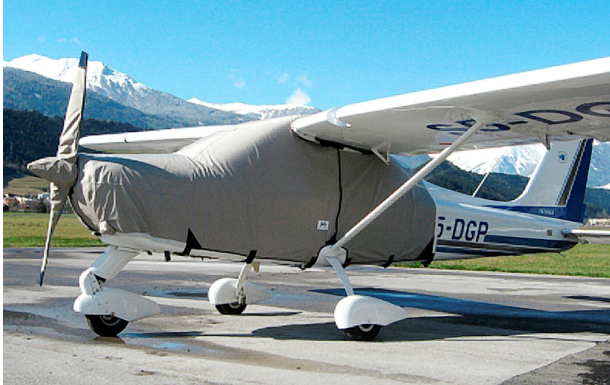
Tecnam Echo Extended Canopy, Engine, Prop Covers

This cover type is made from Silver Acrylic Sunbrella canvas and is 100% lined with a soft and smooth microfiber. Bruce's Custom Covers developed this material combination especially for aircraft protection. The outer material is medium weight and treated for water resistance, UV resistance and anti-static buildup. The inner lining is a very soft and smooth microfiber to prevent scratching. The material is very reflective, and tests show that the cabin interior temperature can be reduced to near-ambient temperature on the hottest of days. It is water, ice and snow repellent, yet breathable to allow moisture to escape from between the cover and the aircraft surface.