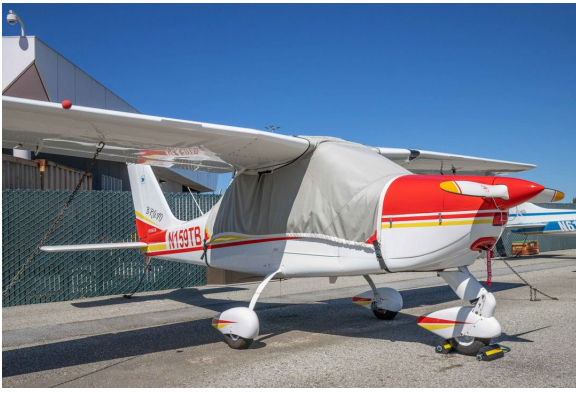
Tecnam P2004 Bravo