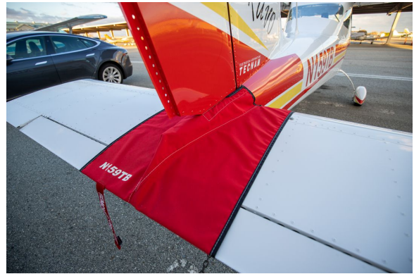
Tecnam Bravo Tailcone Cover