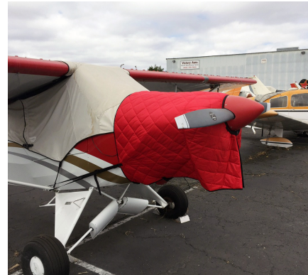
Tecnam Bravo Canopy & Prop Covers, Engine FOR INTERIOR USE. Cub Crafters CC-11 Insulated Hangar Blanket, available in Red or Silver