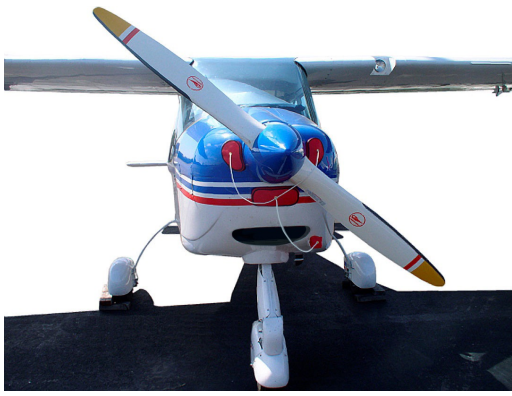
Tecnam Bravo Engine Plugs