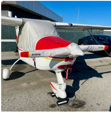
Tecnam Bravo Canopy & Prop Covers, Engine Plugs