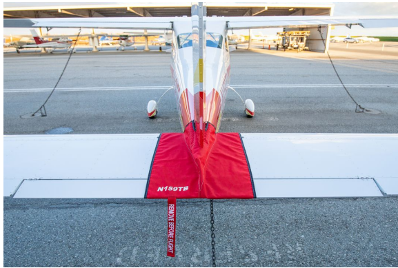
Tecnam Bravo Tailcone Cover

WINTER USE MATERIAL - Made with Solution-Dyed Polyester fabric, this option is intended for seasonal use to aid in deicing, rain mitigation, or for occasional travel. The material is lighter and more compact, but more susceptible to UV damage and may have a shorter useful life if used continuously outside than the all-year use material.