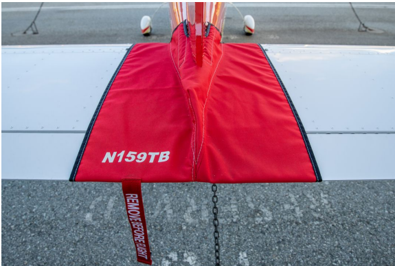
Tecnam Bravo Tailcone Cover

WINTER USE MATERIAL - Made with Solution-Dyed Polyester fabric, this option is intended for seasonal use to aid in deicing, rain mitigation, or for occasional travel. The material is lighter and more compact, but more susceptible to UV damage and may have a shorter useful life if used continuously outside than the all-year use material.