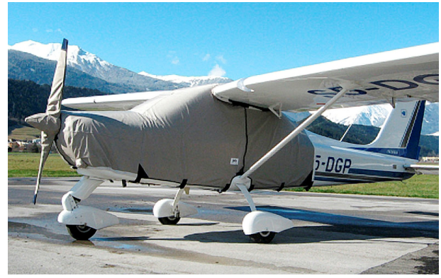
Tecnam Echo Extended Canopy, Engine, Prop Covers