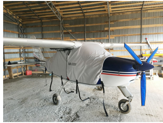
Tecnam P2004 Bravo Extended Canopy Cover, Over-Top Type