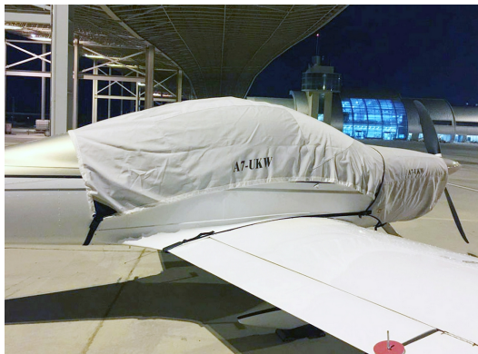
Tecnam Astore Canopy & Engine Covers

This cover type is made from Silver Acrylic Sunbrella canvas and is 100% lined with a soft and smooth microfiber. Bruce's Custom Covers developed this material combination especially for aircraft protection. The outer material is medium weight and treated for water resistance, UV resistance and anti-static buildup. The inner lining is a very soft and smooth microfiber to prevent scratching. The material is very reflective, and tests show that the cabin interior temperature can be reduced to near-ambient temperature on the hottest of days. It is water, ice and snow repellent, yet breathable to allow moisture to escape from between the cover and the aircraft surface.