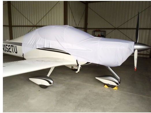
Tecnam Astore Canopy/Engine Cover, test fit cover