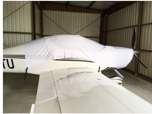
Tecnam Astore Canopy/Engine Cover, test fit cover