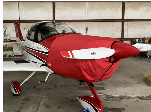
Tecnam Astore Insulated Engine Cover