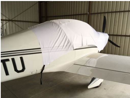
Tecnam Astore Canopy/Engine Cover, test fit cover

This cover type is made from Silver Acrylic Sunbrella canvas and is 100% lined with a soft and smooth microfiber. Bruce's Custom Covers developed this material combination especially for aircraft protection. The outer material is medium weight and treated for water resistance, UV resistance and anti-static buildup. The inner lining is a very soft and smooth microfiber to prevent scratching. The material is very reflective, and tests show that the cabin interior temperature can be reduced to near-ambient temperature on the hottest of days. It is water, ice and snow repellent, yet breathable to allow moisture to escape from between the cover and the aircraft surface.