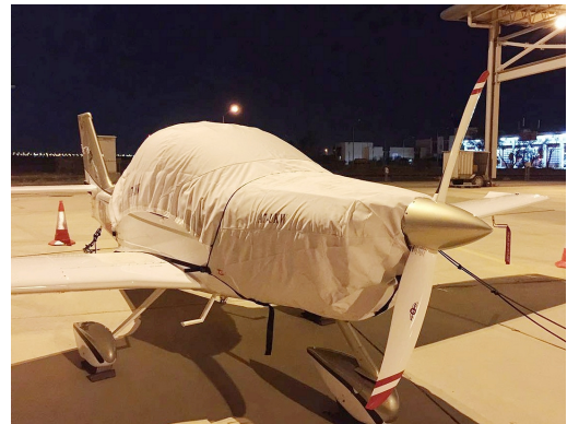
Tecnam Astore Canopy & Engine Covers