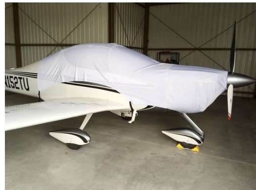
Tecnam Astore Canopy/Engine Cover, test fit cover