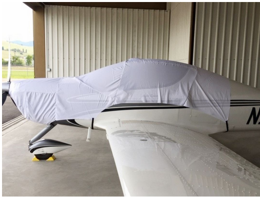
Tecnam Astore Canopy/Engine Cover, test fit cover

This cover type is made from Silver Acrylic Sunbrella canvas and is 100% lined with a soft and smooth microfiber. Bruce's Custom Covers developed this material combination especially for aircraft protection. The outer material is medium weight and treated for water resistance, UV resistance and anti-static buildup. The inner lining is a very soft and smooth microfiber to prevent scratching. The material is very reflective, and tests show that the cabin interior temperature can be reduced to near-ambient temperature on the hottest of days. It is water, ice and snow repellent, yet breathable to allow moisture to escape from between the cover and the aircraft surface.