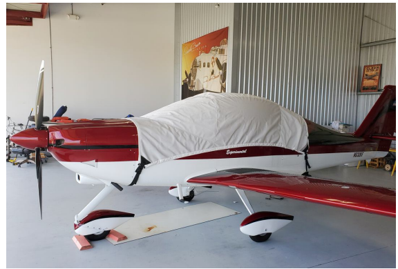
Tecnam Astore Canopy Cover