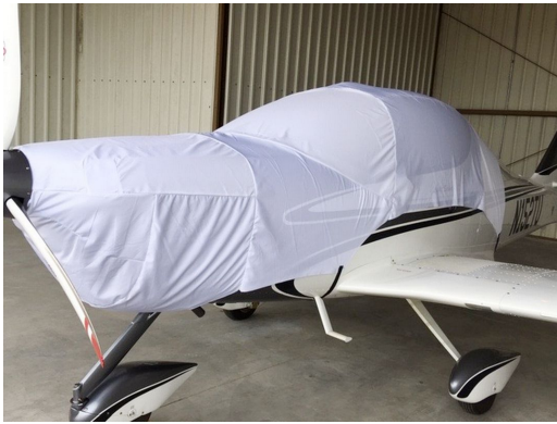
Tecnam Astore Canopy/Engine Cover, test fit cover

Travel Covers are made with Silver Solution-Dyed Polyester fabric and only lined over the windshield to save weight. The material is lightweight and more compact for easy stowage in the aircraft. The polyester material is water resistant, but only intended for occasional use outside. We also have an ultra lightweight material available for fitted hangar dust covers. For daily outdoor use, the non-travel Sunbrella Cover is the best choice.