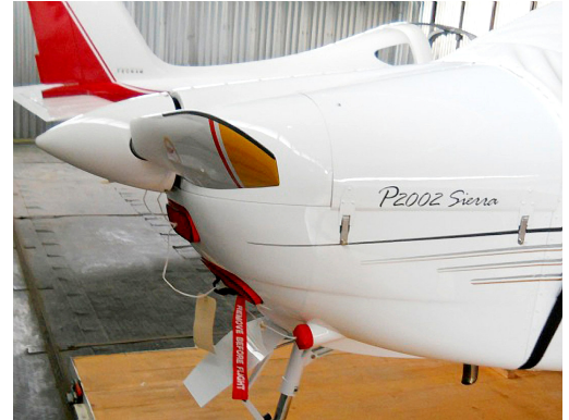
Tecnam Sierra Engine Inlet Plugs set