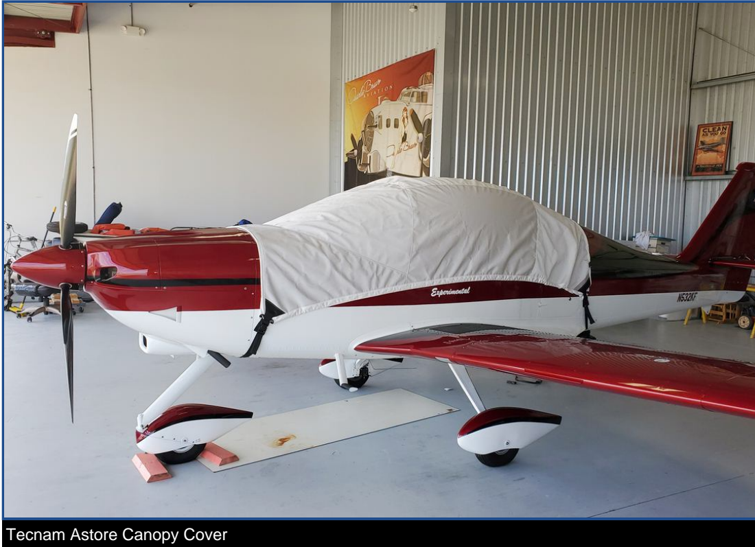
Tecnam Astore Canopy Cover