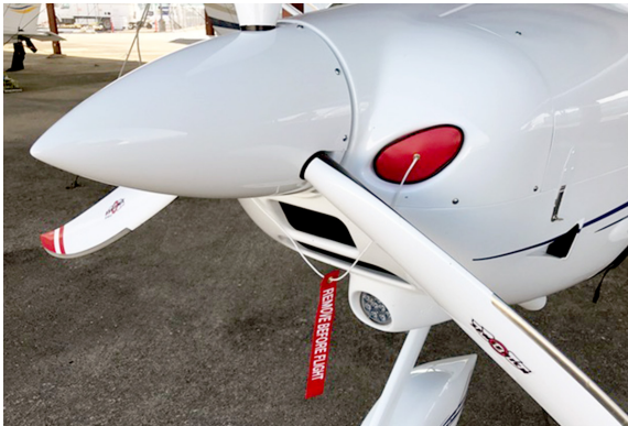
Tecnam P2008 Engine Inlet Plugs

Engine Inlet Plugs are custom fit for your Tecnam P2008 intakes, made with heavy-duty vinyl material, and stuffed with a single block of sculpted urethane foam. Each plug has a zipper that allows the foam to be removed and dried if necessary. Engine plugs have warning flags that are visible from the cockpit or 'remove before flight' streamers sewn onto the face of the plugs. Most plugs are imprinted with the aircraft registration number in black for an extra charge. Storage bag NOT included. Engine plugs may be inserted after flight when the engine is still warm. Engine Inlet Plugs are commonly referred to as Cowl Plugs, Intake Plugs, Cowl Blocks, Engine Blocks, and Engine Bungs.