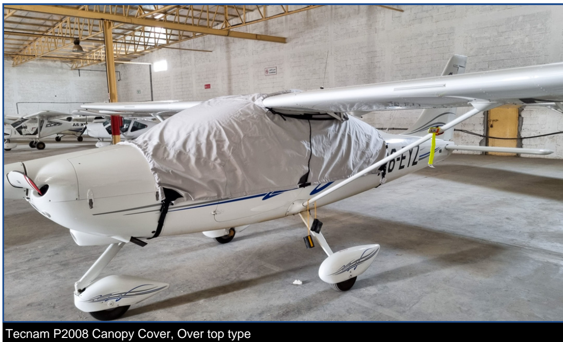
Tecnam P2008 Canopy Cover, Over top type