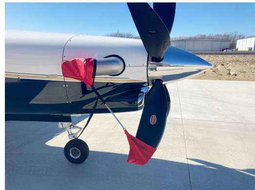
TBM 900 Prop Tie/Exhaust Covers