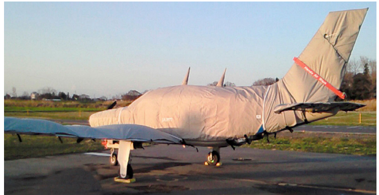
Piper PA-46 Malibu Complete Cover Set