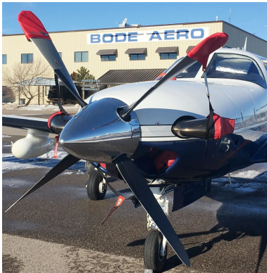
Piper PA46TP-500 Meridian Prop Tie/Exhaust Covers, Engine Plugs