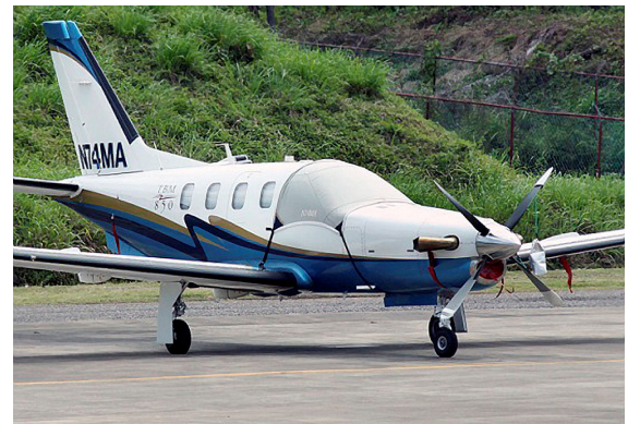
TBM 850 Cockpit Cover