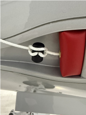
Daher TBM 960 Engine Inlet Plugs, Small NACA Inlets Only TBM 900 Series (set of 3)