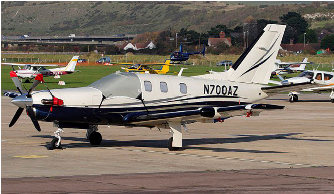
TBM 700 Cockpit Cover, Prop Tie-down/Exhaust Covers, & Engine Inlet Plugs

Engine Inlet Plugs are custom fit for your Socata TBM 700, 750, 850, 900, 910, 930, 940, 960 intakes, made with heavy-duty vinyl material, and stuffed with a single block of sculpted urethane foam. Each plug has a zipper that allows the foam to be removed and dried if necessary. Engine plugs have warning flags that are visible from the cockpit or 'remove before flight' streamers sewn onto the face of the plugs. Most plugs are imprinted with the aircraft registration number in black for an extra charge. Storage bag NOT included. Engine plugs may be inserted after flight when the engine is still warm. Engine Inlet Plugs are commonly referred to as Cowl Plugs, Intake Plugs, Cowl Blocks, Engine Blocks, and Engine Bung s. Designed to prevent damage to the aircraft extremities in crowded hangars, these products are made of bright red Naugahyde and thickly padded with a sandwich of closed cell foam.