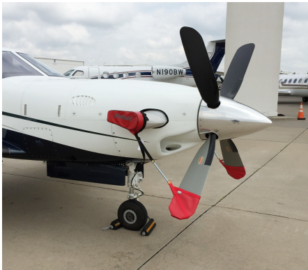
Piper Meridian Prop Tie/Exhaust Cover Set

This cover type is made from Silver Acrylic Sunbrella canvas and is 100% lined with a soft and smooth microfiber. Bruce's Custom Covers developed this material combination especially for aircraft protection. The outer material is medium weight and treated for water resistance, UV resistance and anti-static buildup. The inner lining is a very soft and smooth microfiber to prevent scratching. The material is very reflective, and tests show that the cabin interior temperature can be reduced to near-ambient temperature on the hottest of days. It is water, ice and snow repellent, yet breathable to allow moisture to escape from between the cover and the aircraft surface.