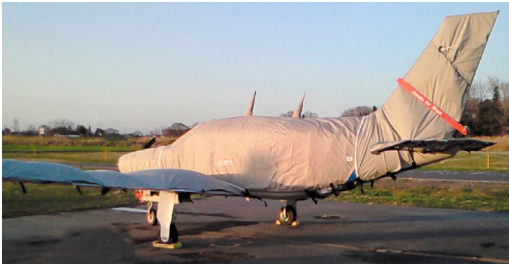
Piper PA-46 Malibu Complete Cover Set