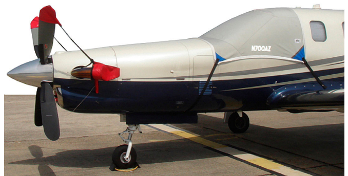
Socata TBM 700 Cockpit Cover, Prop Tie/Exhaust Cover Set TBM700 Cockpit Cover, Engine Plugs, Prop Tie/Exhaust Covers