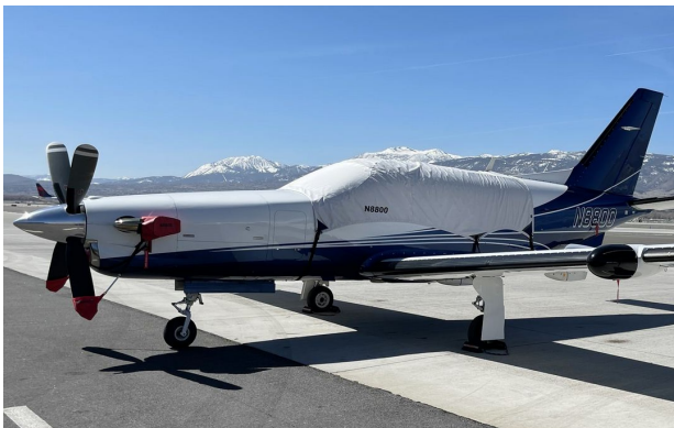
Socata TBM Canopy Cover

This cover type is made from Silver Acrylic Sunbrella canvas and is 100% lined with a soft and smooth microfiber. Bruce's Custom Covers developed this material combination especially for aircraft protection. The outer material is medium weight and treated for water resistance, UV resistance and anti-static buildup. The inner lining is a very soft and smooth microfiber to prevent scratching. The material is very reflective, and tests show that the cabin interior temperature can be reduced to near-ambient temperature on the hottest of days. It is water, ice and snow repellent, yet breathable to allow moisture to escape from between the cover and the aircraft surface.