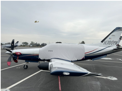
Socata TBM 700 Extended Canopy Cover, Prop Tie/Exhaust Covers