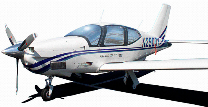
Socata TB20 HeatShields

Windshield Heatshields are interior sunshades for an aircraft's front windshield. The product is a unique composite of closed-cell foam with a silver mylar finish. The semi-rigid design is stiff enough to stand along the inside of the windshield using sun visors or window framing. It folds up flat and easily stores in the included storage sleeve. Some designs may require velcro and suction cups or split right and left sides. A Heatshield is an excellent short-term remedy for cockpit overheating. An external fabric cover is far more effective and practical for long-term protection.