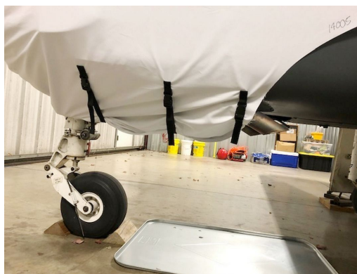
Socata Epsilon TB-30 Insulated Engine Cover, test fit cover