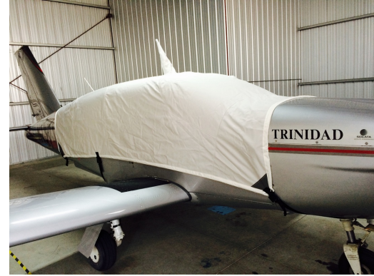
Trinidad Canopy Cover