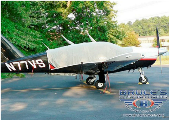
Socata TB20 Canopy Cover

Travel Covers are made with Silver Solution-Dyed Polyester fabric and only lined over the windshield to save weight. The material is lightweight and more compact for easy stowage in the aircraft. The polyester material is water resistant, but only intended for occasional use outside. We also have an ultra lightweight material available for fitted hangar dust covers. For daily outdoor use, the non-travel Sunbrella Cover is the best choice.