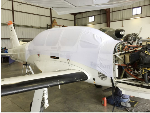
Socata TB30 Epsilon Canopy Cover, test fit cover

This cover type is made from Silver Acrylic Sunbrella canvas and is 100% lined with a soft and smooth microfiber. Bruce's Custom Covers developed this material combination especially for aircraft protection. The outer material is medium weight and treated for water resistance, UV resistance and anti-static buildup. The inner lining is a very soft and smooth microfiber to prevent scratching. The material is very reflective, and tests show that the cabin interior temperature can be reduced to near-ambient temperature on the hottest of days. It is water, ice and snow repellent, yet breathable to allow moisture to escape from between the cover and the aircraft surface.