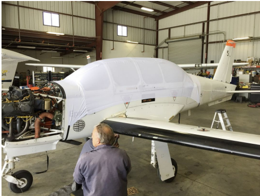
Socata TB30 Epsilon Canopy Cover, test fit cover