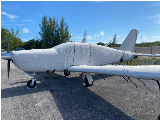
Socata TB-20 Trinidad Complete Cover Set