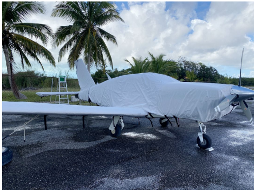
Socata Trinidad Full Cover Set