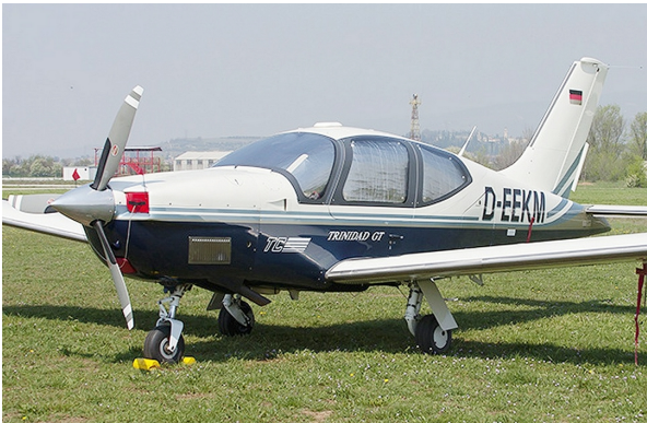
TB-9 Engine Plugs and HeatShields