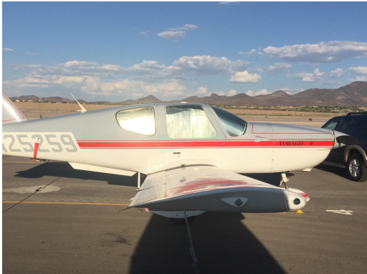
Socata TB-10 Cabin HeatShields

Windshield Heatshields are interior sunshades for an aircraft's front windshield. The product is a unique composite of closed-cell foam with a silver mylar finish. The semi-rigid design is stiff enough to stand along the inside of the windshield using sun visors or window framing. It folds up flat and easily stores in the included storage sleeve. Some designs may require velcro and suction cups or split right and left sides. A Heatshield is an excellent short-term remedy for cockpit overheating. An external fabric cover is far more effective and practical for long-term protection.