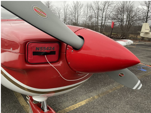
Socata Tobago Engine Plugs

Engine Inlet Plugs are custom fit for your Socata TB9-GT, Tobago: TB10-GT & TB200-GT, Trinidad: TB20-GT, TB21-GT intakes, made with heavy-duty vinyl material, and stuffed with a single block of sculpted urethane foam. Each plug has a zipper that allows the foam to be removed and dried if necessary. Engine plugs have warning flags that are visible from the cockpit or 'remove before flight' streamers sewn onto the face of the plugs. Most plugs are imprinted with the aircraft registration number in black for an extra charge. Storage bag NOT included. Engine plugs may be inserted after flight when the engine is still warm. Engine Inlet Plugs are commonly referred to as Cowl Plugs, Intake Plugs, Cowl Blocks, Engine Blocks, and Engine Bungs.