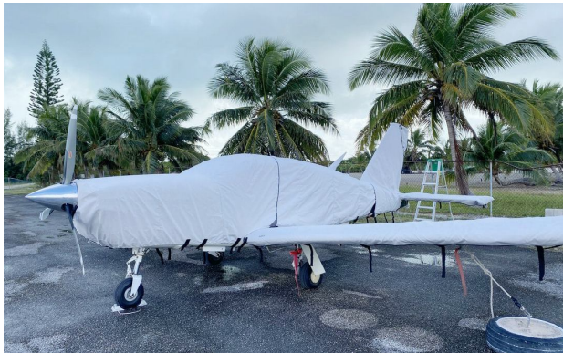
Socata Trinidad Full Cover Set

This cover type is made from Silver Acrylic Sunbrella canvas and is 100% lined with a soft and smooth microfiber. Bruce's Custom Covers developed this material combination especially for aircraft protection. The outer material is medium weight and treated for water resistance, UV resistance and anti-static buildup. The inner lining is a very soft and smooth microfiber to prevent scratching. The material is very reflective, and tests show that the cabin interior temperature can be reduced to near-ambient temperature on the hottest of days. It is water, ice and snow repellent, yet breathable to allow moisture to escape from between the cover and the aircraft surface.