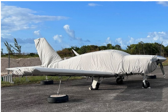
Socata TB-20 Trinidad Complete Cover Set

WINTER USE MATERIAL - Made with Solution-Dyed Polyester fabric, this option is intended for seasonal use to aid in deicing, rain mitigation, or for occasional travel. The material is lighter and more compact, but more susceptible to UV damage and may have a shorter useful life if used continuously outside than the all-year use material.