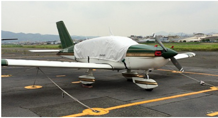
Socata TB-20 Canopy Cover