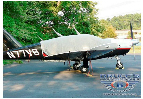
Socata TB20 Canopy Cover