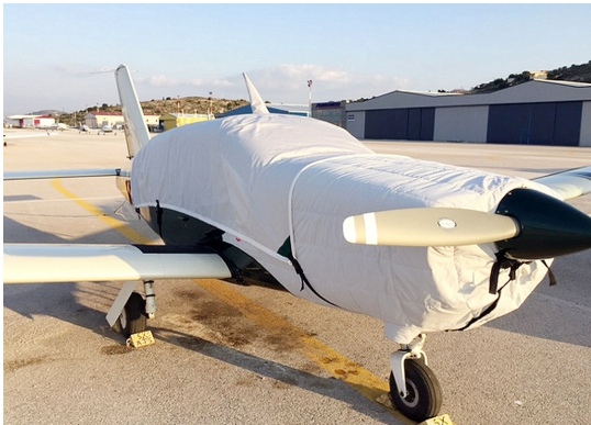
Socata TB-20 Canopy Cover, Insulated Engine Cover

This cover type is made from Silver Acrylic Sunbrella canvas and is 100% lined with a soft and smooth microfiber. Bruce's Custom Covers developed this material combination especially for aircraft protection. The outer material is medium weight and treated for water resistance, UV resistance and anti-static buildup. The inner lining is a very soft and smooth microfiber to prevent scratching. The material is very reflective, and tests show that the cabin interior temperature can be reduced to near-ambient temperature on the hottest of days. It is water, ice and snow repellent, yet breathable to allow moisture to escape from between the cover and the aircraft surface.