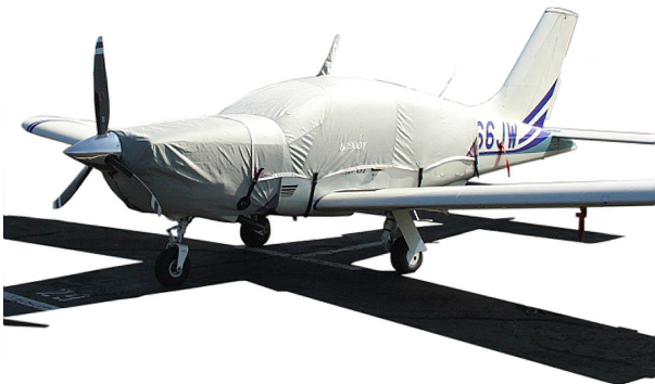
Canopy Cover & Engine Cover