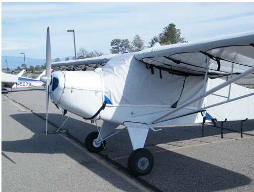
Taylorcraft Over-Top Canopy Cover & Wing Covers

WINTER USE MATERIAL - Made with Solution-Dyed Polyester fabric, this option is intended for seasonal use to aid in deicing, rain mitigation, or for occasional travel. The material is lighter and more compact, but more susceptible to UV damage and may have a shorter useful life if used continuously outside than the all-year use material.