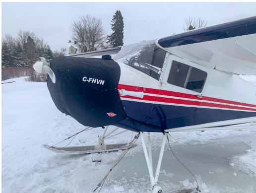
Taylorcraft Models B & F Insulated Engine Cover

This cover type is made from Silver Acrylic Sunbrella canvas and is 100% lined with a soft and smooth microfiber. Bruce's Custom Covers developed this material combination especially for aircraft protection. The outer material is medium weight and treated for water resistance, UV resistance and anti-static buildup. The inner lining is a very soft and smooth microfiber to prevent scratching. The material is very reflective, and tests show that the cabin interior temperature can be reduced to near-ambient temperature on the hottest of days. It is water, ice and snow repellent, yet breathable to allow moisture to escape from between the cover and the aircraft surface.