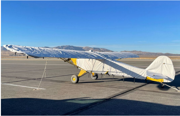
Taylorcraft BC-12D Extended Canopy, Wing & Empennage Covers

This cover type is made from Silver Acrylic Sunbrella canvas and is 100% lined with a soft and smooth microfiber. Bruce's Custom Covers developed this material combination especially for aircraft protection. The outer material is medium weight and treated for water resistance, UV resistance and anti-static buildup. The inner lining is a very soft and smooth microfiber to prevent scratching. The material is very reflective, and tests show that the cabin interior temperature can be reduced to near-ambient temperature on the hottest of days. It is water, ice and snow repellent, yet breathable to allow moisture to escape from between the cover and the aircraft surface.