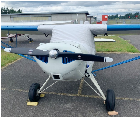
Taylorcraft Models F19 Over-The-Top Canopy Cover