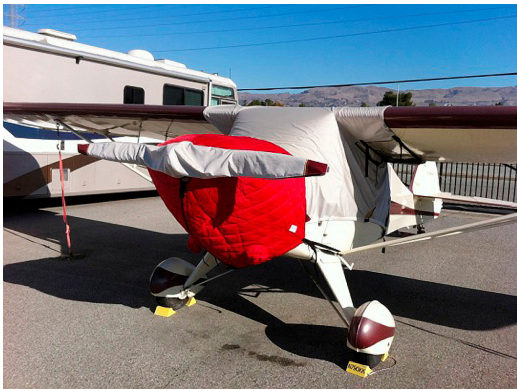
Taylorcraft Insulated Engine Cover, Prop and Canopy Covers

This cover type is made from Silver Acrylic Sunbrella canvas and is 100% lined with a soft and smooth microfiber. Bruce's Custom Covers developed this material combination especially for aircraft protection. The outer material is medium weight and treated for water resistance, UV resistance and anti-static buildup. The inner lining is a very soft and smooth microfiber to prevent scratching. The material is very reflective, and tests show that the cabin interior temperature can be reduced to near-ambient temperature on the hottest of days. It is water, ice and snow repellent, yet breathable to allow moisture to escape from between the cover and the aircraft surface.