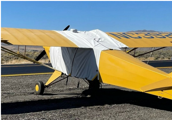
Taylorcraft BC-12D Extended Canopy Cover

This cover type is made from Silver Acrylic Sunbrella canvas and is 100% lined with a soft and smooth microfiber. Bruce's Custom Covers developed this material combination especially for aircraft protection. The outer material is medium weight and treated for water resistance, UV resistance and anti-static buildup. The inner lining is a very soft and smooth microfiber to prevent scratching. The material is very reflective, and tests show that the cabin interior temperature can be reduced to near-ambient temperature on the hottest of days. It is water, ice and snow repellent, yet breathable to allow moisture to escape from between the cover and the aircraft surface.