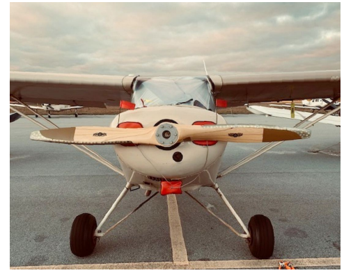
Taylorcraft Engine Inlet Plugs