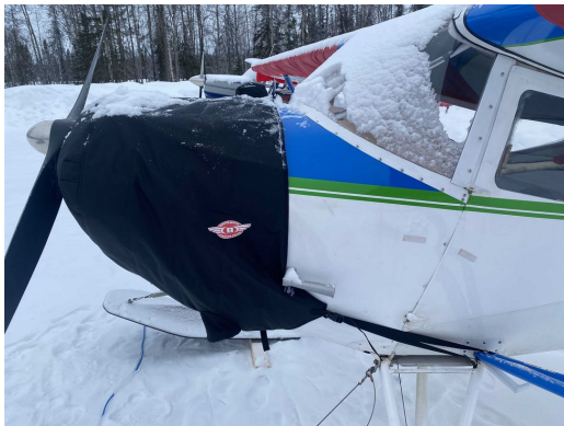
Taylorcraft Insulated Engine Cover