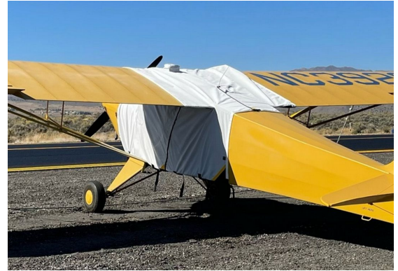
Taylorcraft BC-12D Extended Canopy Cover