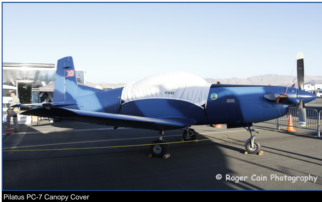
Pilatus PC-7 Canopy Cover