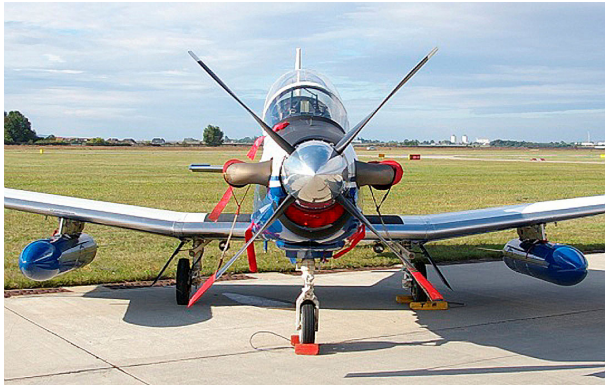
Texan II T6A Engine Inlet Plug, Prop Tie/Exhaust Covers

necessary. Engine plugs have warning flags that are visible from the cockpit or 'remove before flight' streamers sewn onto the face of the plugs. Most plugs are imprinted with the aircraft registration number in black for an extra charge. Storage bag NOT included. Engine plugs may be inserted after flight when the engine is still warm. Engine Inlet Plugs are commonly referred to as Cowl Plugs, Intake Plugs, Cowl Blocks, Engine Blocks, and Engine Bungs.