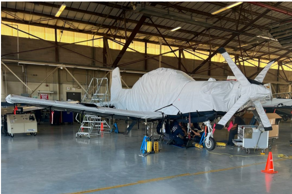
Beech T-6A Texan 2 Complete Hail Protection Cover Set