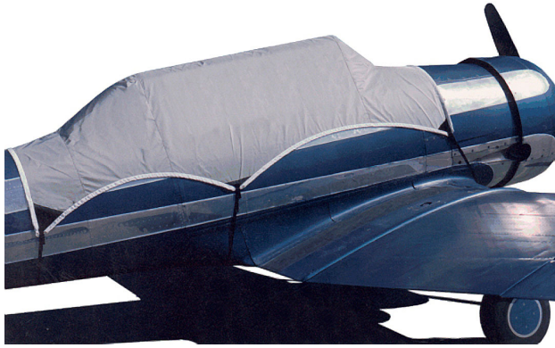
Canopy Cover with Forward Extension

This cover type is made from Silver Acrylic Sunbrella canvas and is 100% lined with a soft and smooth microfiber. Bruce's Custom Covers developed this material combination especially for aircraft protection. The outer material is medium weight and treated for water resistance, UV resistance and anti-static buildup. The inner lining is a very soft and smooth microfiber to prevent scratching. The material is very reflective, and tests show that the cabin interior temperature can be reduced to near-ambient temperature on the hottest of days. It is water, ice and snow repellent, yet breathable to allow moisture to escape from between the cover and the aircraft surface.