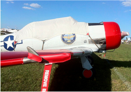
T6 Pitot, Canopy & Prop Covers

Travel Covers are made with Silver Solution-Dyed Polyester fabric and only lined over the windshield to save weight. The material is lightweight and more compact for easy stowage in the aircraft. The polyester material is water resistant, but only intended for occasional use outside. We also have an ultra lightweight material available for fitted hangar dust covers. For daily outdoor use, the non-travel Sunbrella Cover is the best choice.