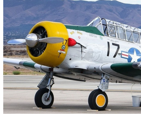
North American T6 Carb Air Scoop Cover