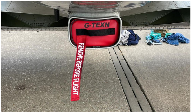
T6 Harvard Chin Scoop Plug