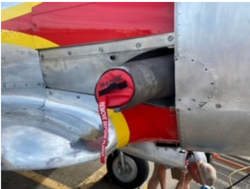
North American T6 Chin Exhaust Plug

Engine Inlet Plugs are custom fit for your North American T6, SNJ, Harvard intakes, made with heavy-duty vinyl material, and stuffed with a single block of sculpted urethane foam. Each plug has a zipper that allows the foam to be removed and dried if necessary. Engine plugs have warning flags that are visible from the cockpit or 'remove before flight' streamers sewn onto the face of the plugs. Most plugs are imprinted with the aircraft registration number in black for an extra charge. Storage bag NOT included. Engine plugs may be inserted after flight when the engine is still warm. Engine Inlet Plugs are commonly referred to as Cowl Plugs, Intake Plugs, Cowl Blocks, Engine Blocks, and Engine Bungs.