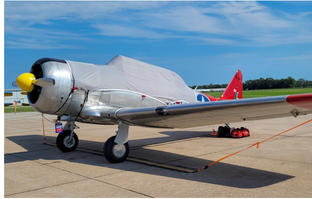
North American T6 Travel Cover, Light Weight Canopy Cover with 50" fwd ext