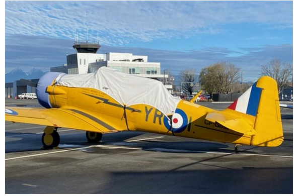
North American T6 Canopy Cover w/50" Forward Extension