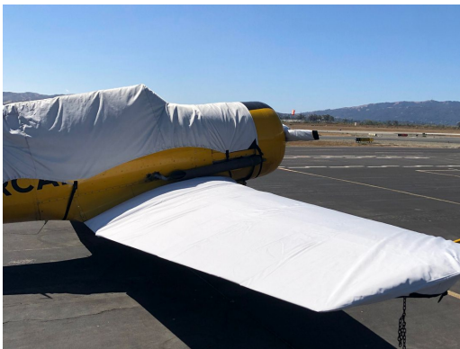
North American Harvard T6 Canopy & Wing Covers

WINTER USE MATERIAL - Made with Solution-Dyed Polyester fabric, this option is intended for seasonal use to aid in deicing, rain mitigation, or for occasional travel. The material is lighter and more compact, but more susceptible to UV damage and may have a shorter useful life if used continuously outside than the all-year use material.