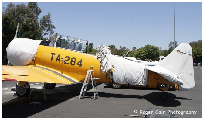
North American T6 Engine & Empennage Cover