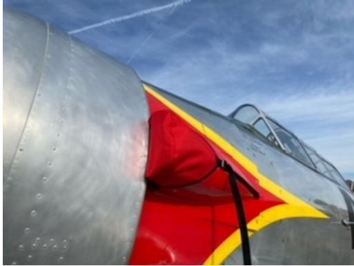
North American T6 Carb Air Scoop Cover