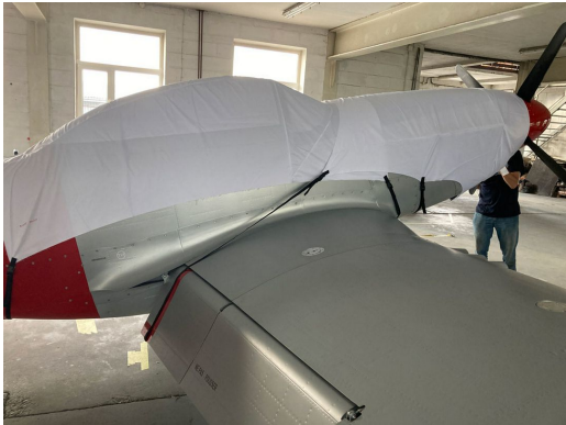
Scalewings SW-51 Mustang Canopy & Engine Covers, test fit covers

This cover type is made from Silver Acrylic Sunbrella canvas and is 100% lined with a soft and smooth microfiber. Bruce's Custom Covers developed this material combination especially for aircraft protection. The outer material is medium weight and treated for water resistance, UV resistance and anti-static buildup. The inner lining is a very soft and smooth microfiber to prevent scratching. The material is very reflective, and tests show that the cabin interior temperature can be reduced to near-ambient temperature on the hottest of days. It is water, ice and snow repellent, yet breathable to allow moisture to escape from between the cover and the aircraft surface.