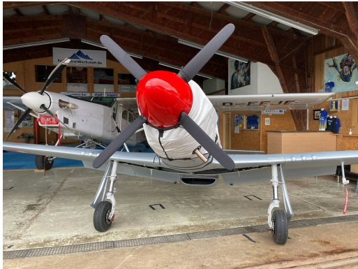
SW-51 Mustang Engine Cover

This cover type is made from Silver Acrylic Sunbrella canvas and is 100% lined with a soft and smooth microfiber. Bruce's Custom Covers developed this material combination especially for aircraft protection. The outer material is medium weight and treated for water resistance, UV resistance and anti-static buildup. The inner lining is a very soft and smooth microfiber to prevent scratching. The material is very reflective, and tests show that the cabin interior temperature can be reduced to near-ambient temperature on the hottest of days. It is water, ice and snow repellent, yet breathable to allow moisture to escape from between the cover and the aircraft surface.