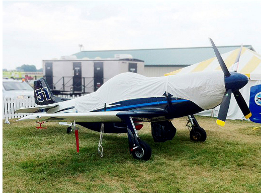
Thunder Mustang Canopy & Engine Cover

This cover type is made from Silver Acrylic Sunbrella canvas and is 100% lined with a soft and smooth microfiber. Bruce's Custom Covers developed this material combination especially for aircraft protection. The outer material is medium weight and treated for water resistance, UV resistance and anti-static buildup. The inner lining is a very soft and smooth microfiber to prevent scratching. The material is very reflective, and tests show that the cabin interior temperature can be reduced to near-ambient temperature on the hottest of days. It is water, ice and snow repellent, yet breathable to allow moisture to escape from between the cover and the aircraft surface.