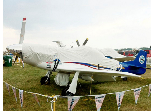
Thunder Mustang Canopy & Engine Cover